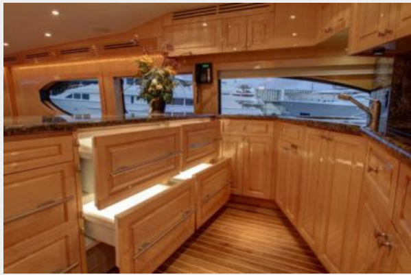
Galley Sub-Zero Refrigerator Drawers