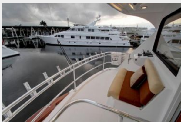
Aft Flybridge Bench Seating