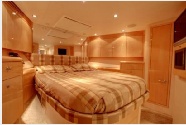
Guest VIP Stateroom / Bow (2)