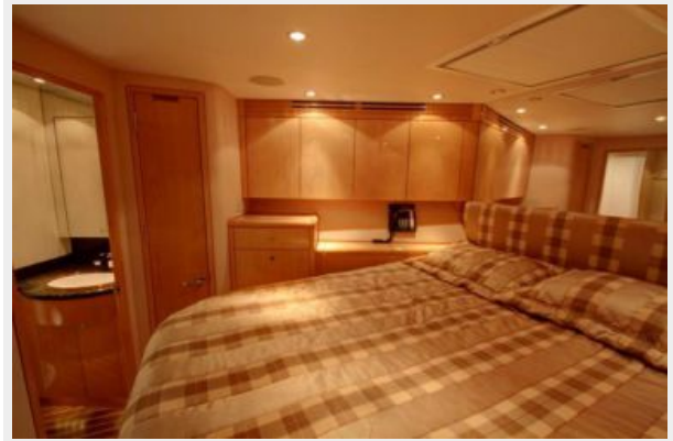
Guest VIP Stateroom / Bow (3)