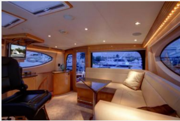
Flybridge / Aft