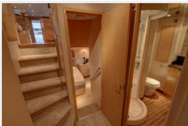
Lower Companionway (2)