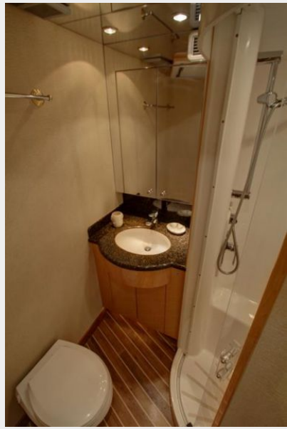
Guest Stateroom Head (2)