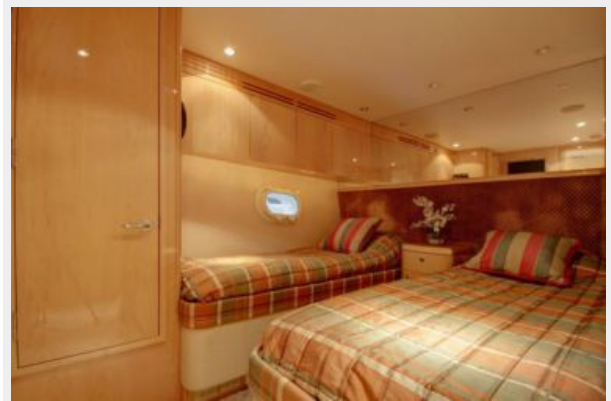
Guest Stateroom Twin Beds / Starboard