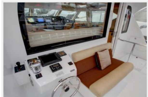
Aft Flybridge Seating w/Control Station