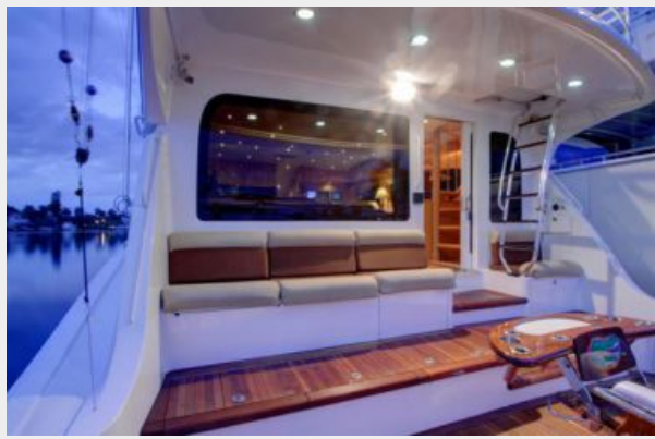
Cockpit Forward to Salon