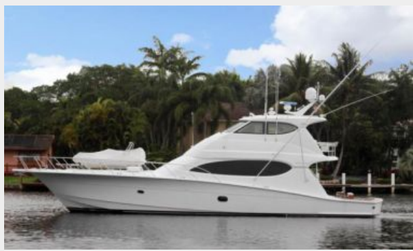
EVA VI Port Profile