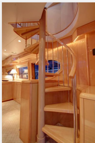
Salon Stairwell to Flybridge