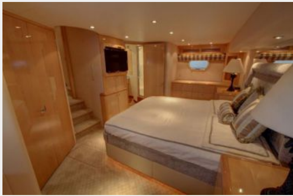
Master Stateroom / Starboard (2)