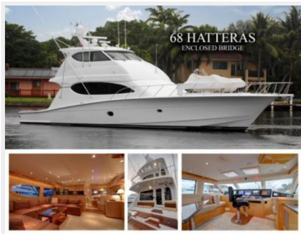
EVA VI Collage