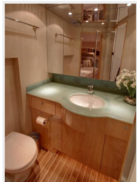
Master Stateroom Head / Vanity