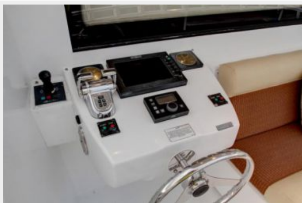
Aft Flybridge Control Station