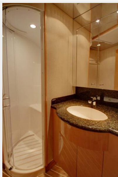
Guest VIP Stateroom Head