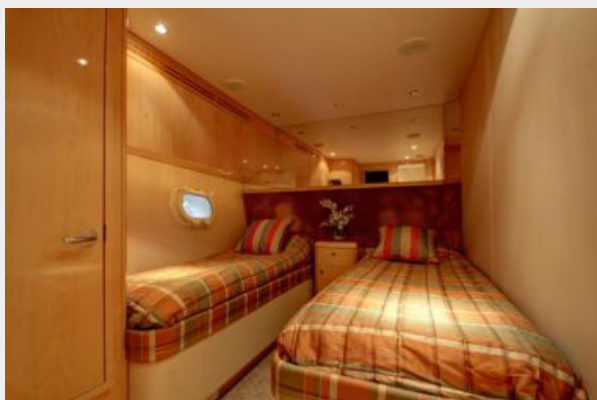
Guest Stateroom Twin Beds / Starboard (2)