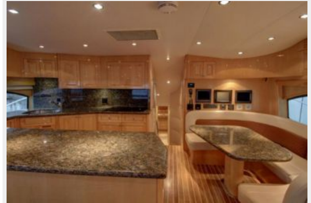
Galley Granite Counter / Dinette Tabletop