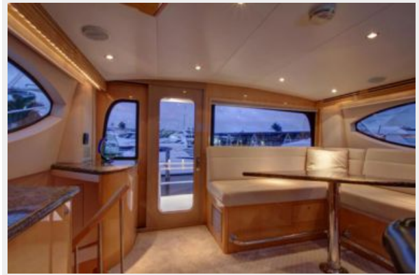
Flybridge / Aft (2)