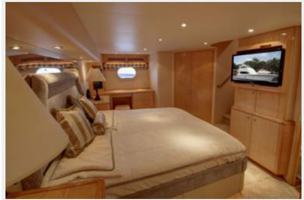
Master Stateroom Head / Vanity