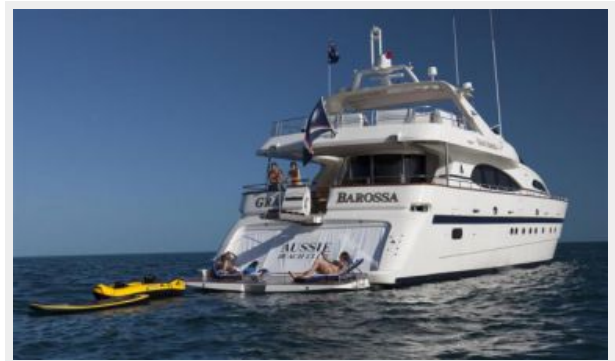
Aussie Beach 1