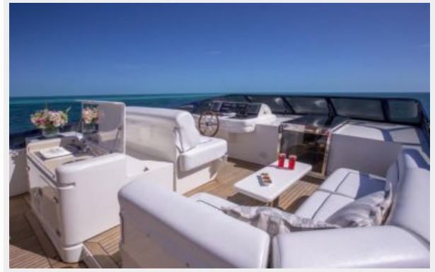
Fly Bridge C