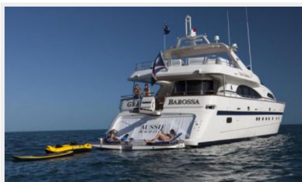
Aussie Beach 1