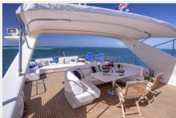
Fly Bridge B