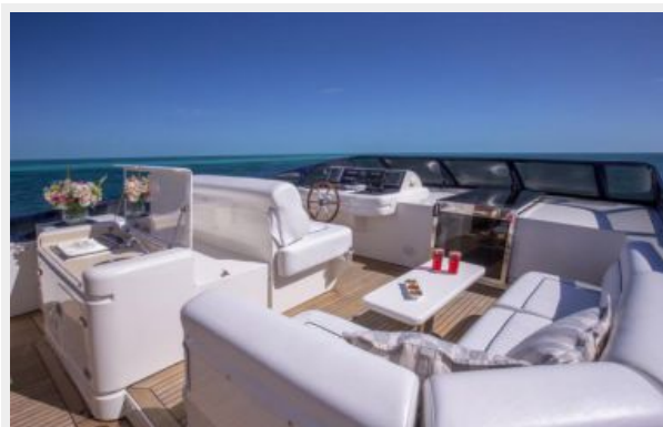
Fly Bridge C