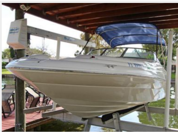
Port Bow View