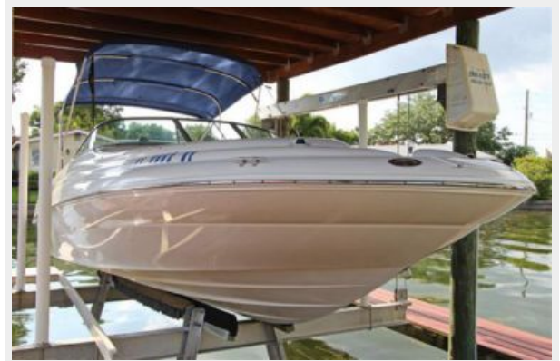
Starboard Bow View with Bimini Top