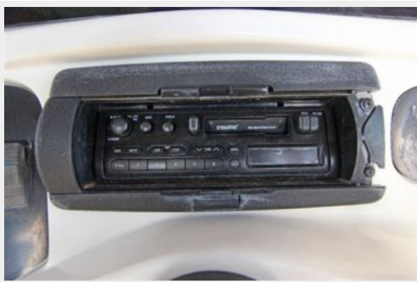
Coustic CD Player