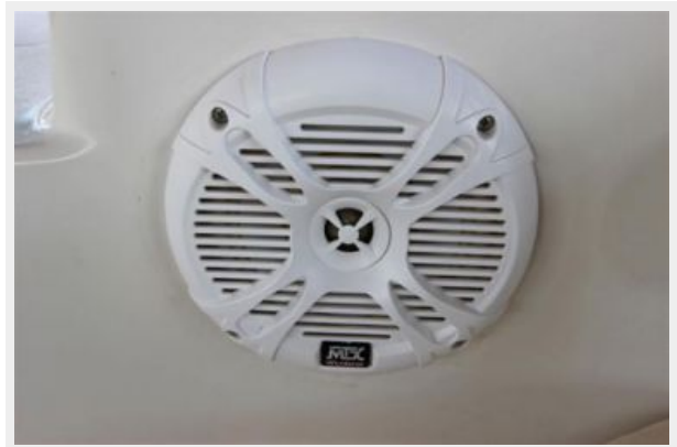
MTX Marine Speakers