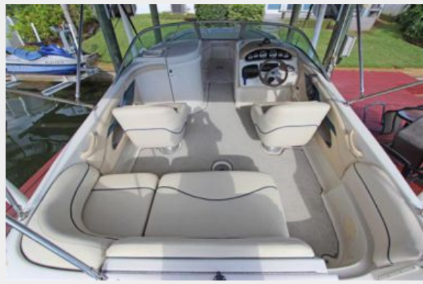
View from Swim Platform forward to Bow