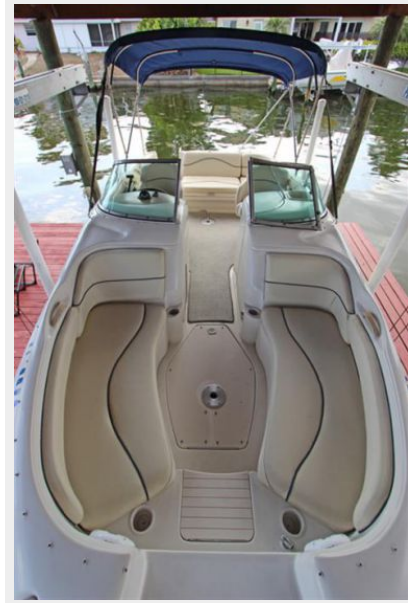
Bow Seating looking Aft