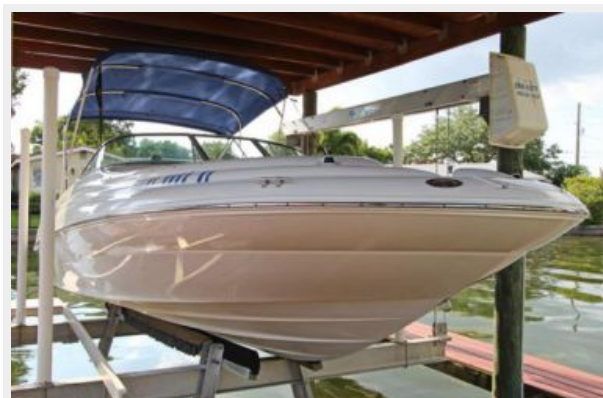
Starboard Bow View with Bimini Top