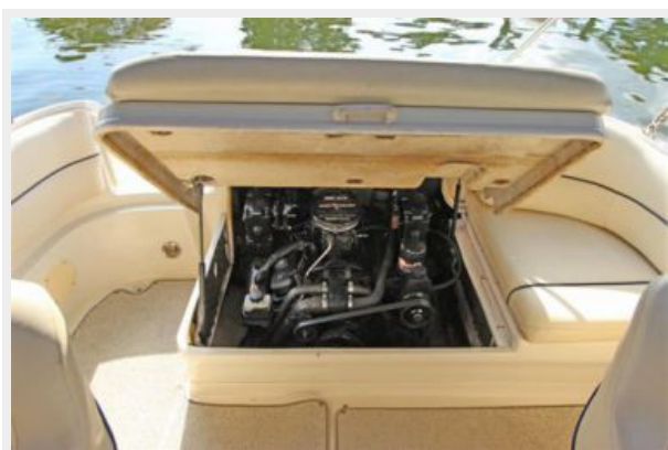
Insulated Engine Compartment under stern seat - With Gas Assist Lift