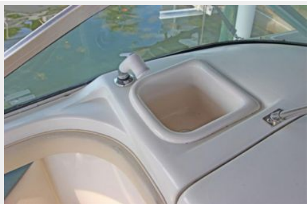
Portside Wet Sink