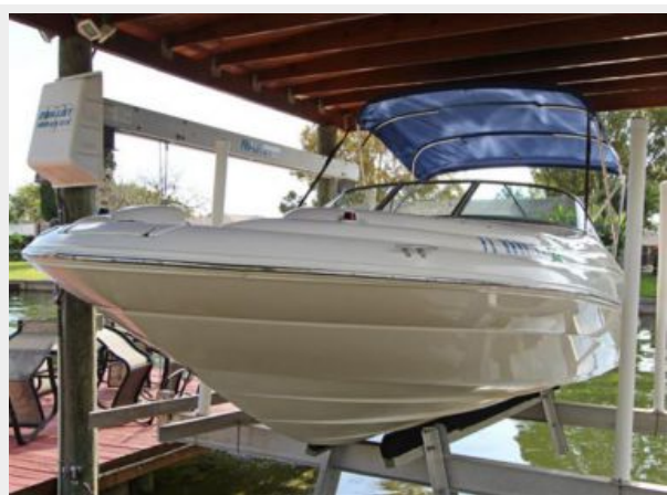
Port Bow View