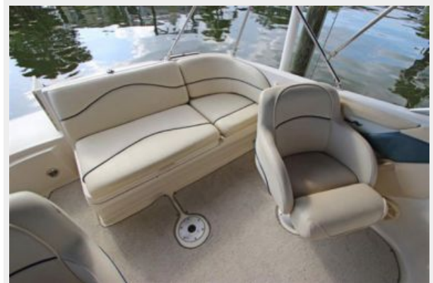
Cockpit Seating & Companion Swivel Seat