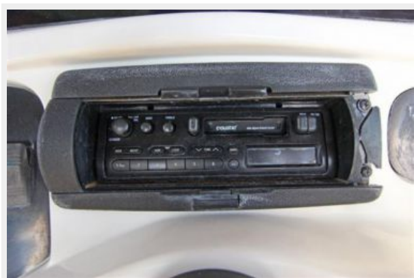
Coustic CD Player