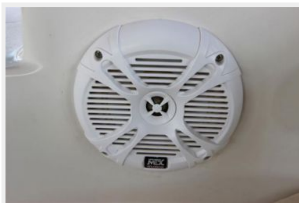
MTX Marine Speakers