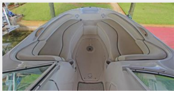
Bow Seating lookign forward and Walk-Thru Windshield