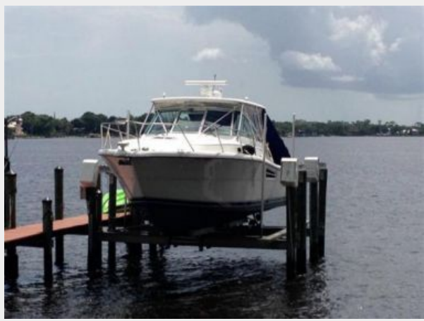
Port fwd on lift