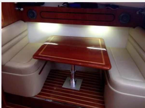
Teak inlaid dinette table