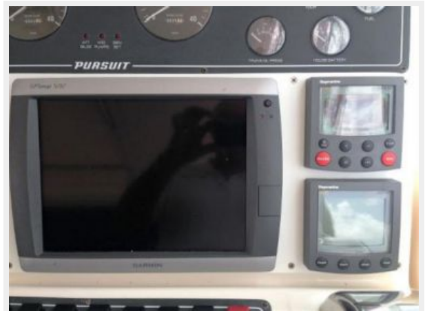
Garmin 5212 touchscreen plotter