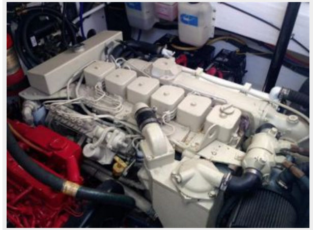
Stbd Cummins diesel