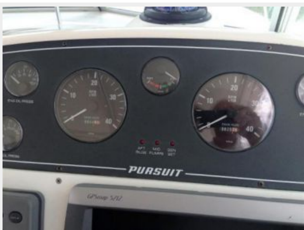
Tachs w/hour meters