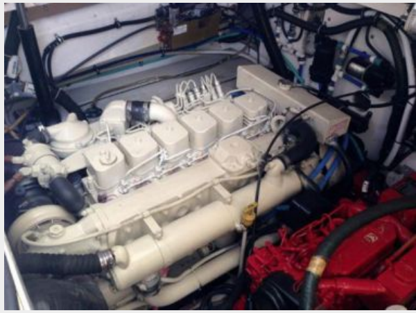
Port Cummins diesel