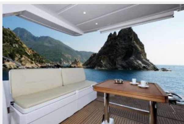
sistership aft deck