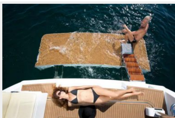
sistership swim platform