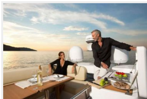
sistership fly bridge