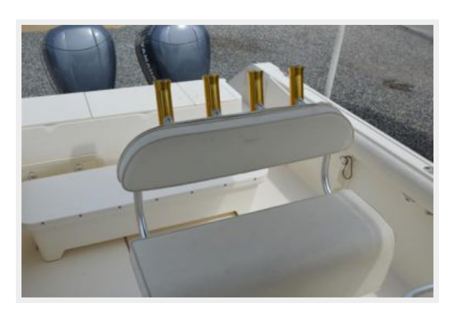
Pursuit 2470 Center Console Leaning Post w/Rocket Launchers