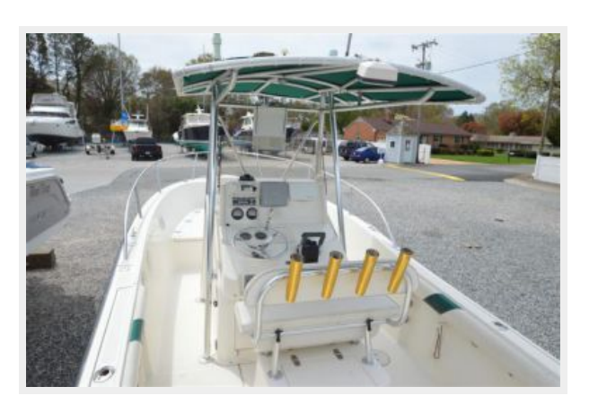
Pursuit 2470 Center Console Helm & leaning Post