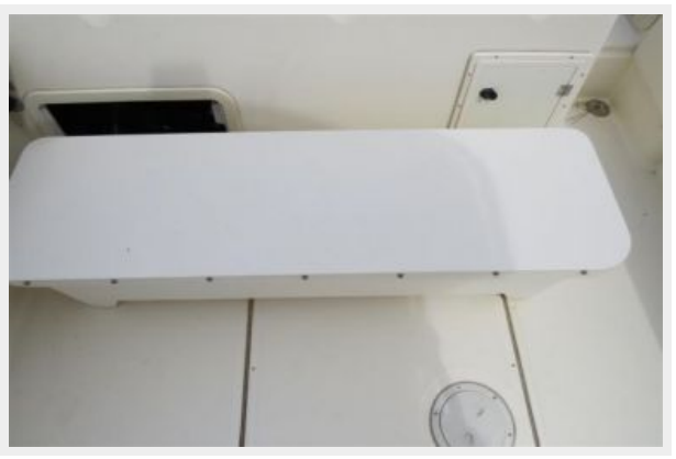
Pursuit 2470 Center Console Aft Removable Seating