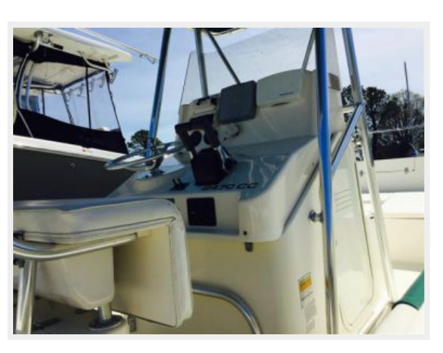
Pursuit 2470 Center Console Forward Seating