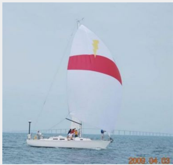
RUNNING DOWNWIND W/SPINNAKER