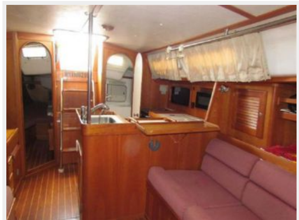
SALON STARBOARD SIDE AFT