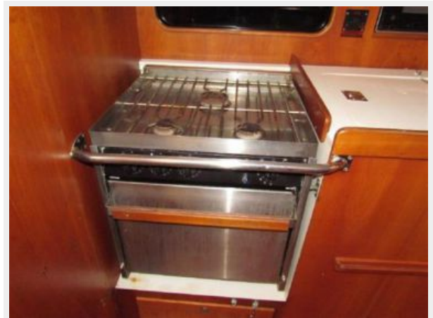
FORCE 10 PROPANE STOVE