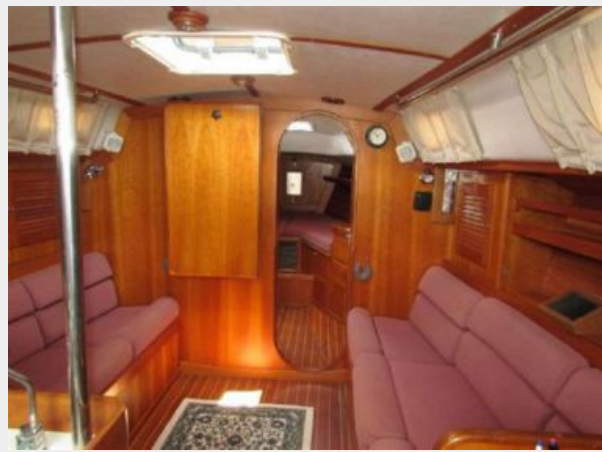
MAIN SALON- FORWARD