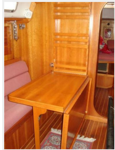
DINETTE TABLE- HALF