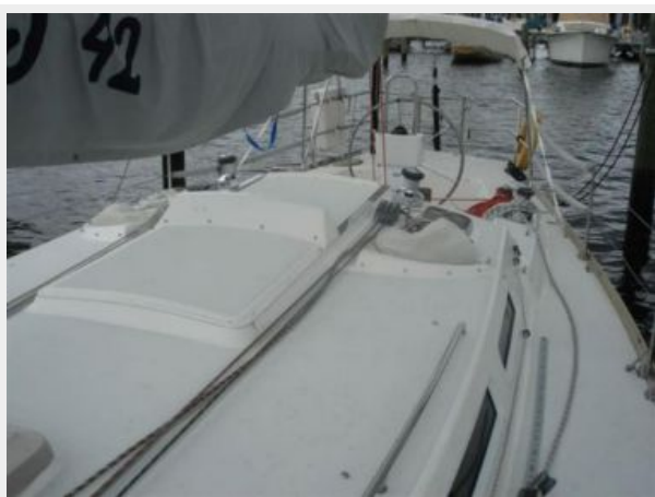
DECK & COCKPIT LOOKING AFT