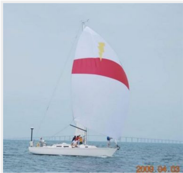
RUNNING DOWNWIND W/SPINNAKER