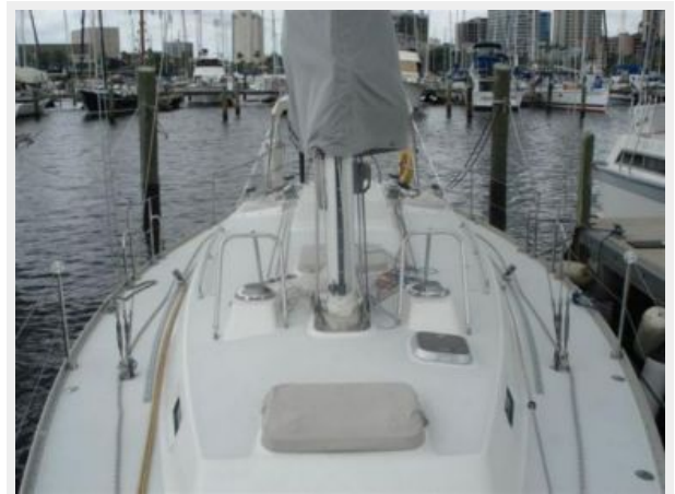
DECK LOOKING AFT