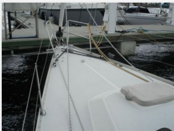
DECK LOOKING AFT