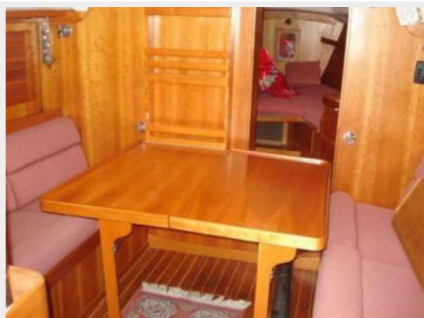
SALON - PORT SIDE LOOKING AFT