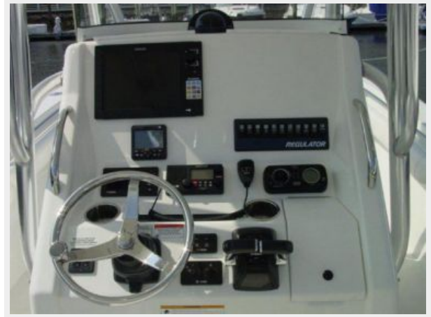
Electronics & Navigation