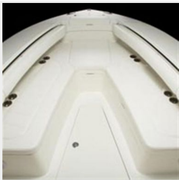
Sistership Deck Seating