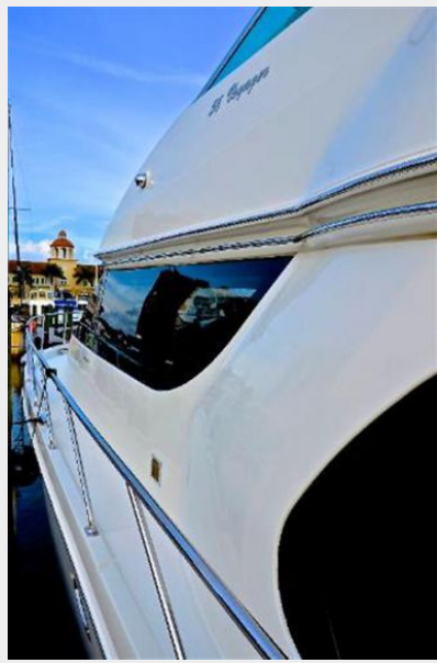
Port Side Detail