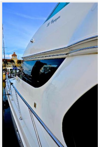
Port Side Detail