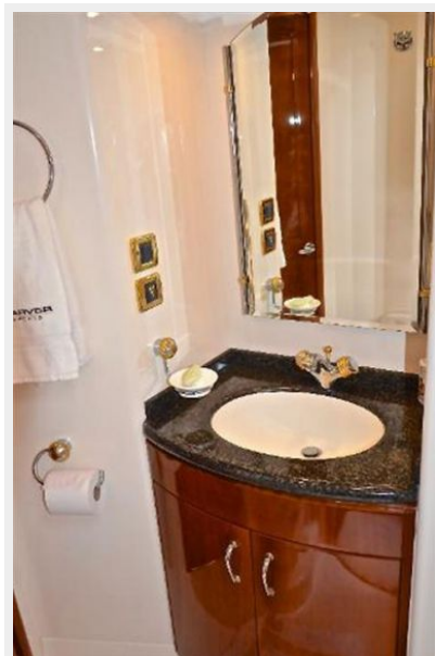
Master Stateroom Wash Basin