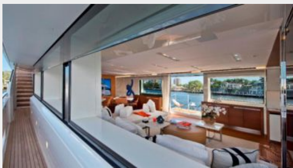
OPENING SALON WINDOWS