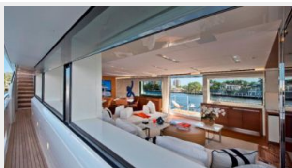
OPENING SALON WINDOWS