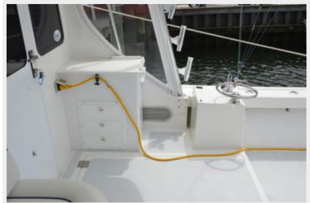
JUDGE YACHTS 42XC Cockpit Helm & Bait Station