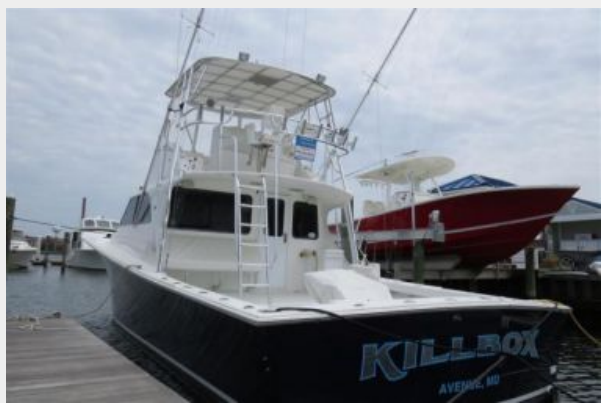
JUDGE YACHTS 42XC Profile