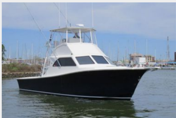
JUDGE YACHTS 42XC Profile