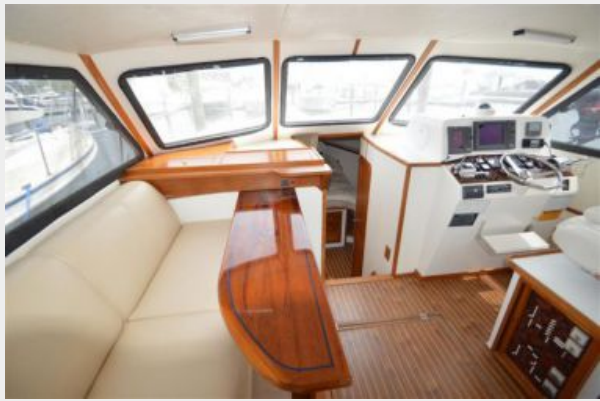
JUDGE YACHTS 42XC Salon Seating