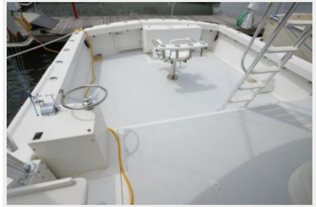
JUDGE YACHTS 42XC Cockpit