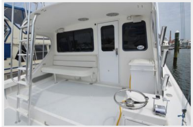
JUDGE YACHTS 42XC Cockpit Seating