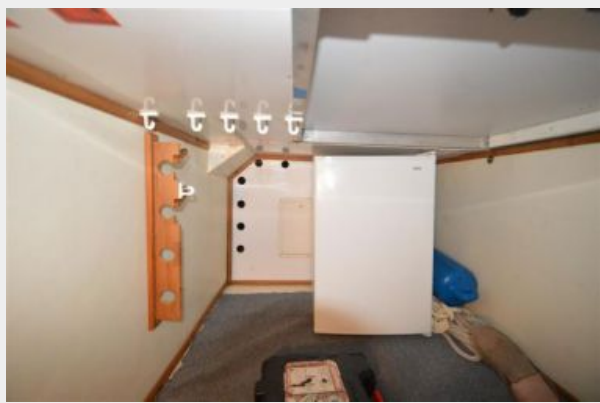
JUDGE YACHTS 42XC Tackle & Rod Storage Room