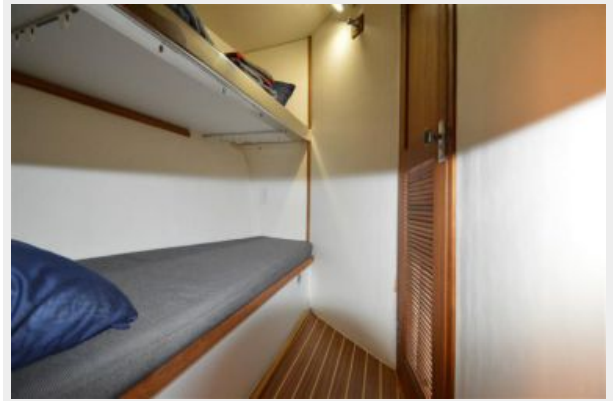
JUDGE YACHTS 42XC Companionway