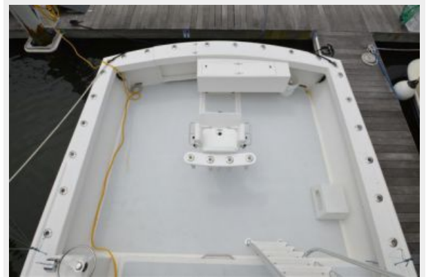
JUDGE YACHTS 42XC Cockpit