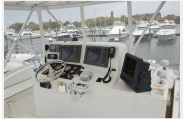
JUDGE YACHTS 42XC Upper Helm