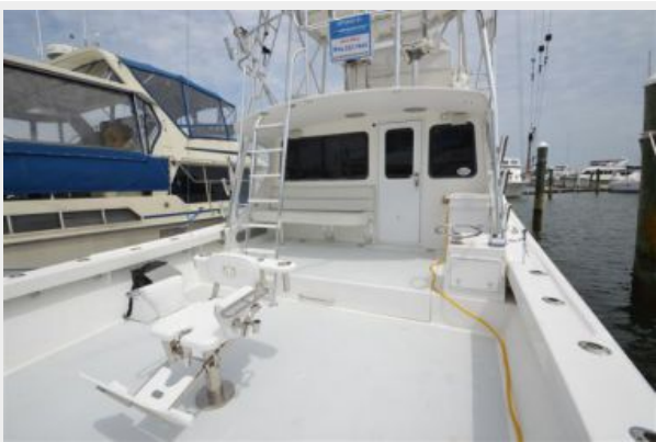
JUDGE YACHTS 42XC Cockpit