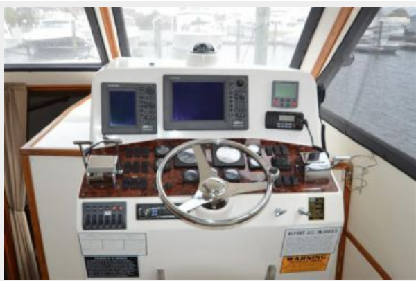
JUDGE YACHTS 42XC Lower Helm