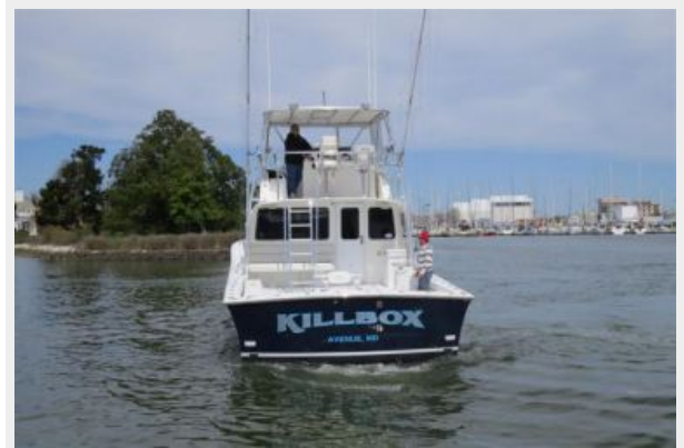
JUDGE YACHTS 42XC Profile