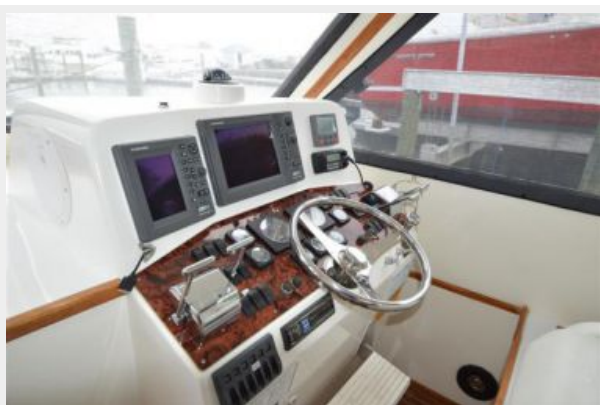
JUDGE YACHTS 42XC