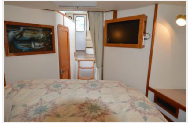
JUDGE YACHTS 42XC Master Stateroom