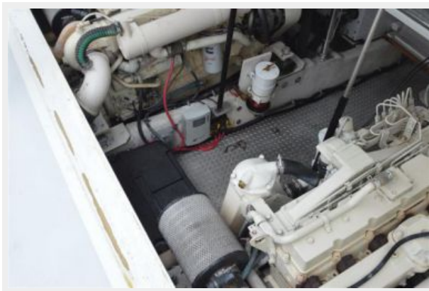
JUDGE YACHTS 42XC Engine Room