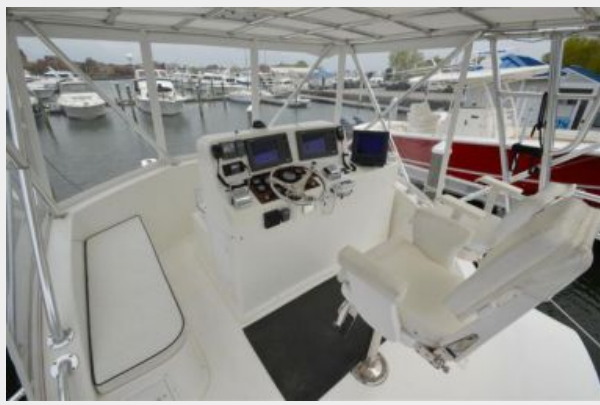
JUDGE YACHTS 42XC Upper Helm