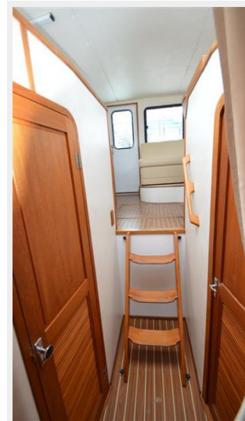
JUDGE YACHTS 42XC Companionway