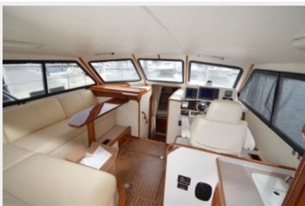
JUDGE YACHTS 42XC Salon