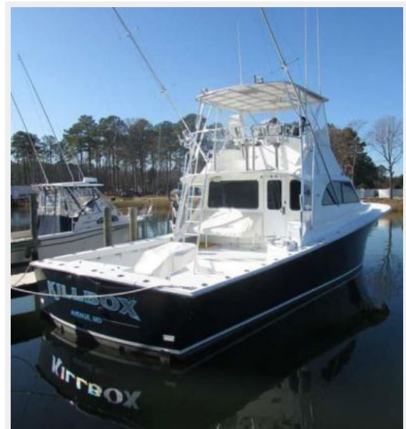
JUDGE YACHTS 42XC Profile