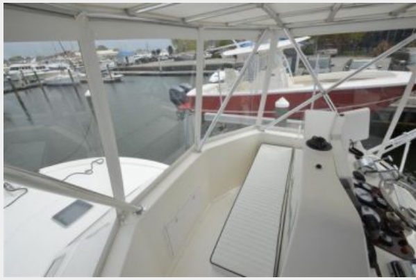
JUDGE YACHTS 42XC Flybridge Seating