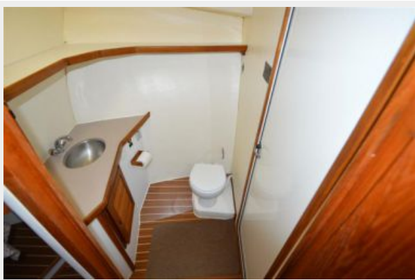
JUDGE YACHTS 42XC Head with Enclosed Shower