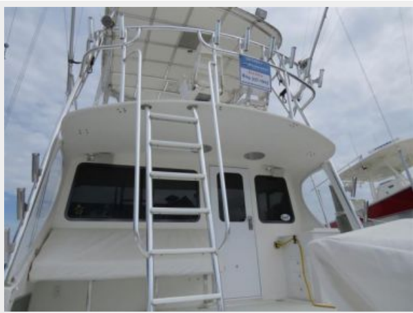
JUDGE YACHTS 42XC Bridge Ladder