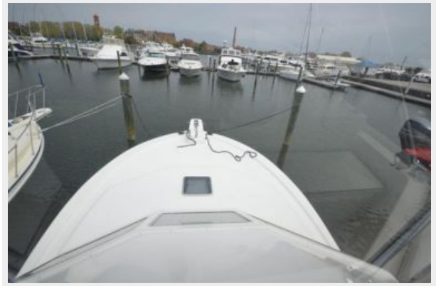
JUDGE YACHTS 42XC Bow