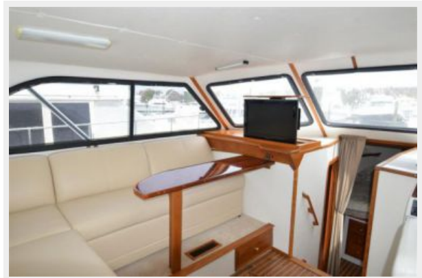
JUDGE YACHTS 42XC Salon TV