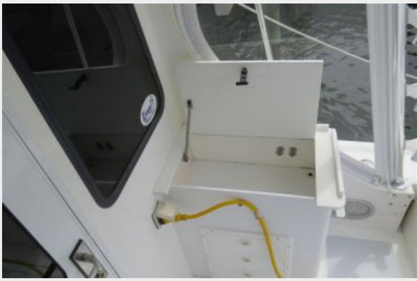
JUDGE YACHTS 42XC Bait Station