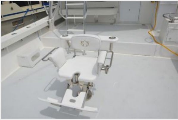
JUDGE YACHTS 42XC Fighting Chair