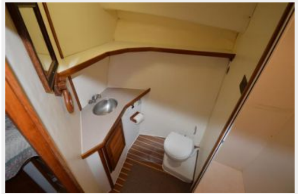
JUDGE YACHTS 42XC Head