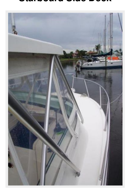
Starboard Side Deck