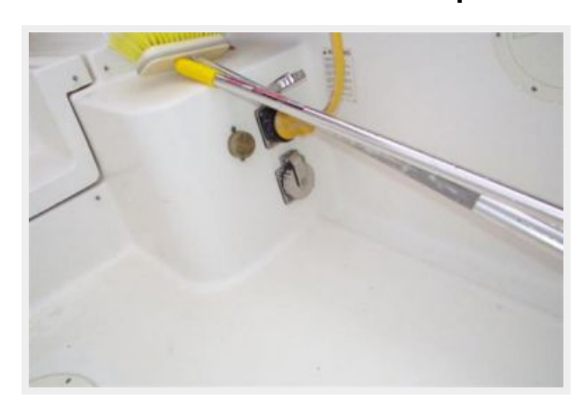
Dockside Power Hook Up