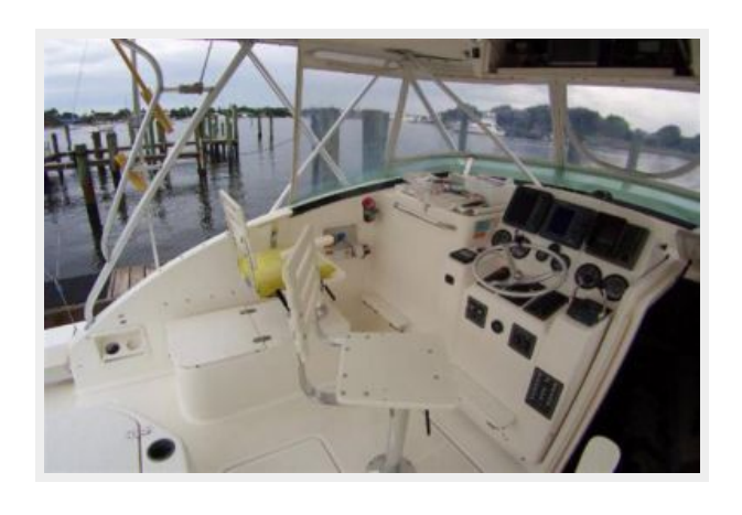
Helm to Port