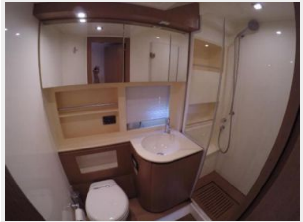
Master Stateroom ensuite Head / Shower