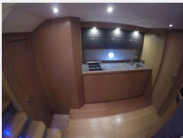
Facing Port - Galley