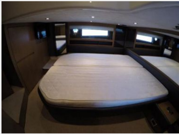
Full Beam Master Stateroom