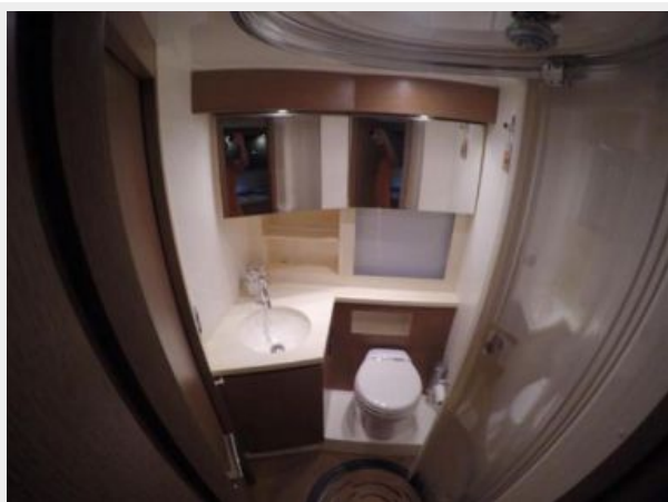
Day Head / Shower