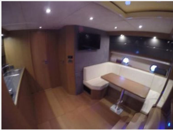
Facing Starboard - Settee