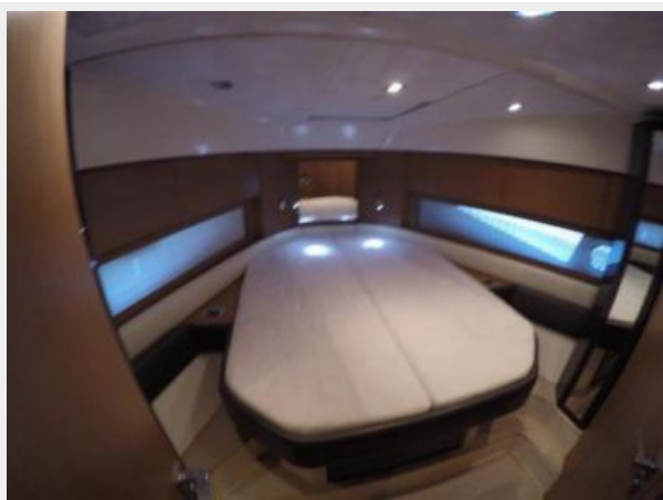
Forward VIP Berth with entrance to head/shower