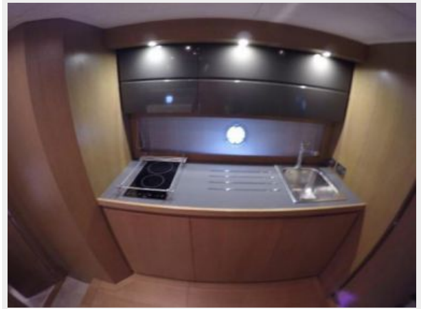
Galley / Two refrigerators-freezers under