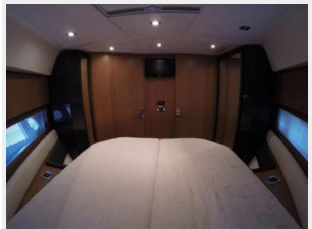
Forward VIP Berth facing aft