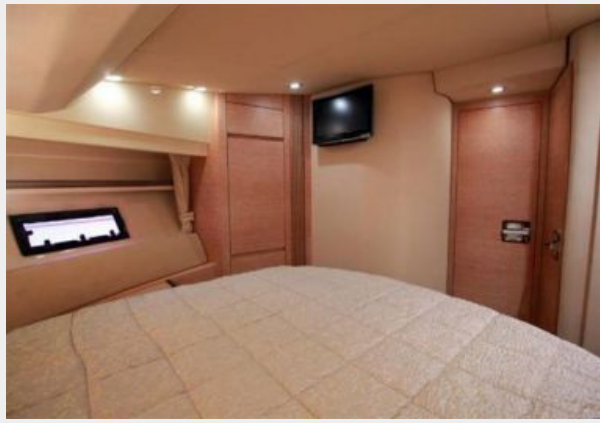
Forward Stateroom 2