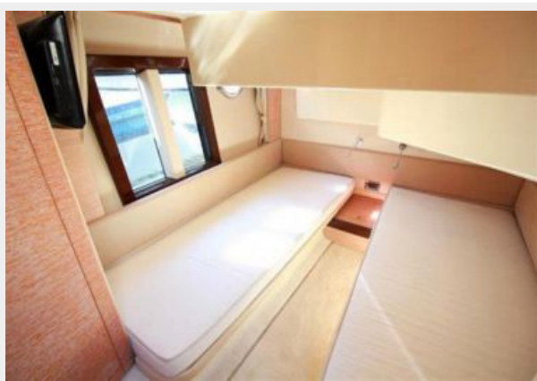
Starboard Stateroom 2