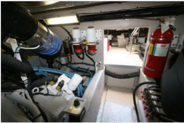
Engine Room Aft