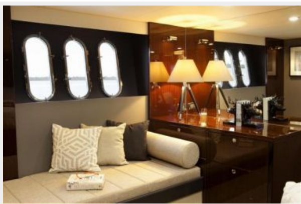
Day Bed in Master Stateroom