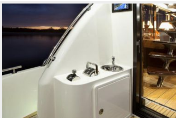
Cockpit Docking Station