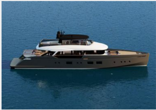
Liberty 33m Exterior "T-TOP"