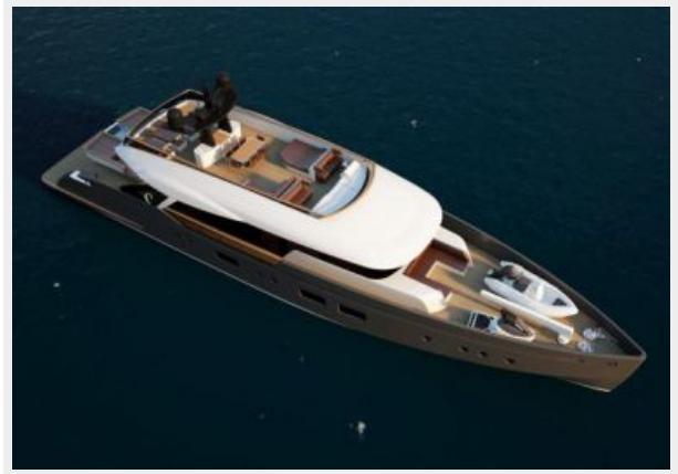
Liberty 33m Bow "Without T-TOP"