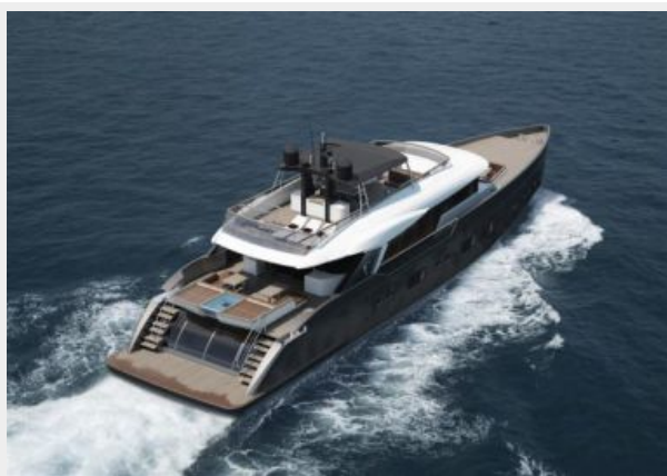
Liberty 33m Cruising "T-TOP"