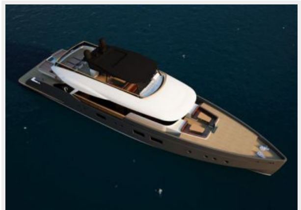
Liberty 33m Aerial "T-TOP"