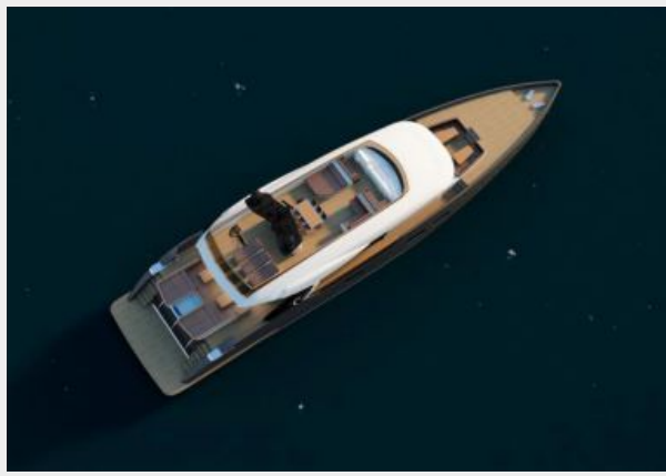
Liberty 33m Aerial View "Without T-TOP"