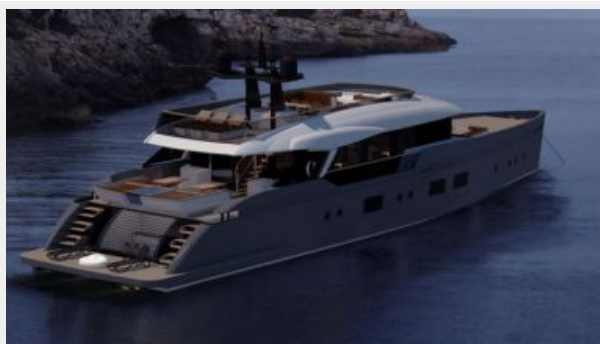
Liberty 33m Stern "Without T-TOP"