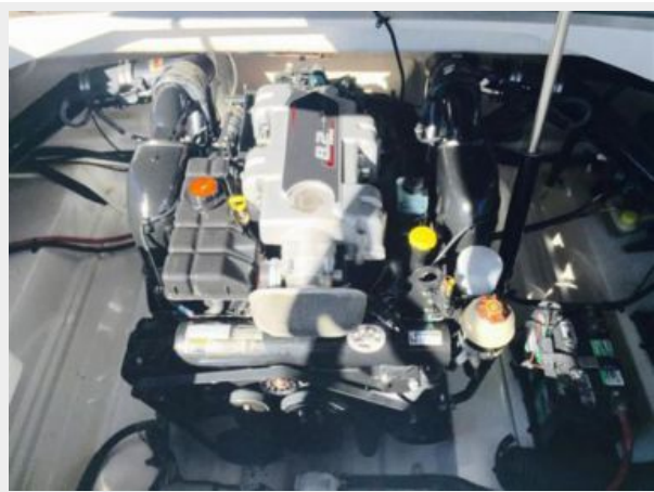
MerCruiser 8.2LMPI 380hp