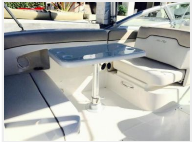
Aft Cockpit Settee