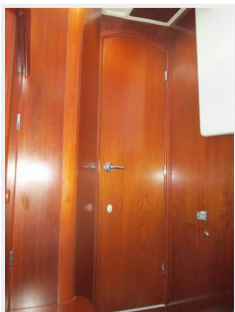
Aft Cabin 4