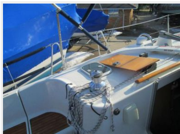
#40 Lewmar Electric Winch