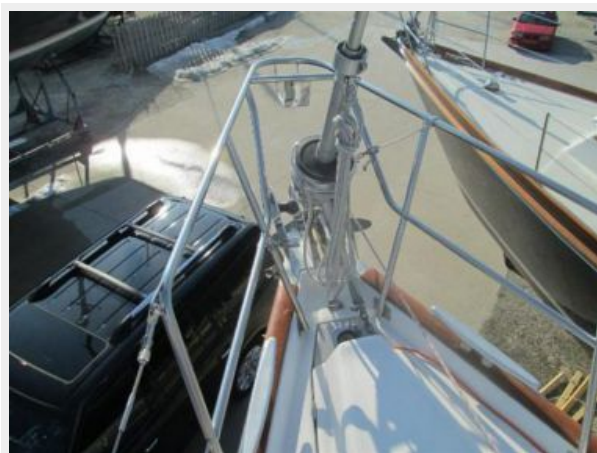
Bow with Profurl Furler