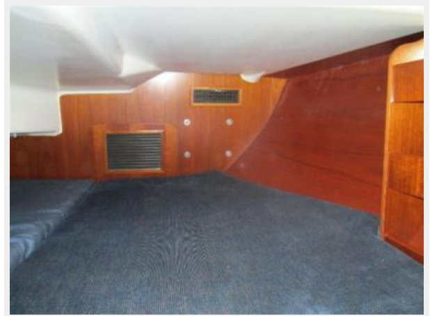
Aft Cabin Berth 1