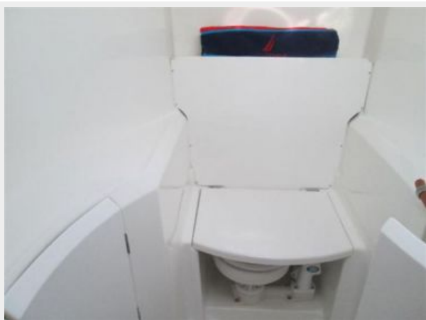
Forward Head 2