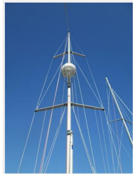
New Raymarine 48 mile radar