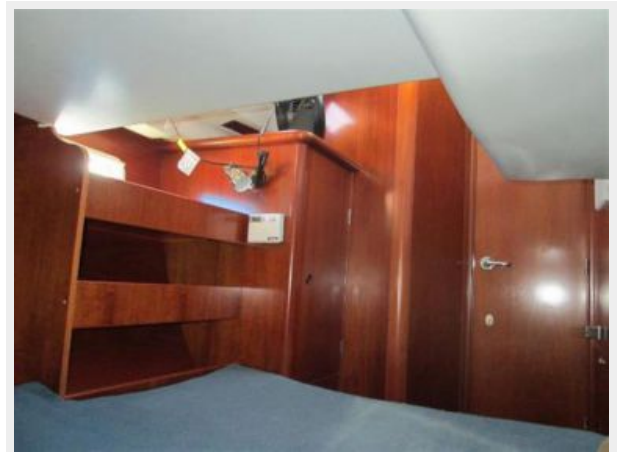
Aft Cabin Hanging locker and Storage