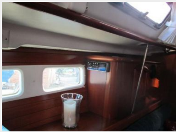
Salon looking forward and port