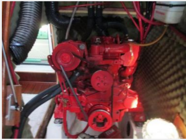
Very Clean engine