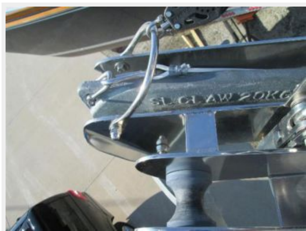
Lewmar Claw 20KG