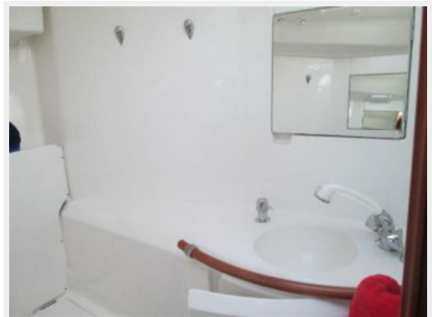
Forward Head 1