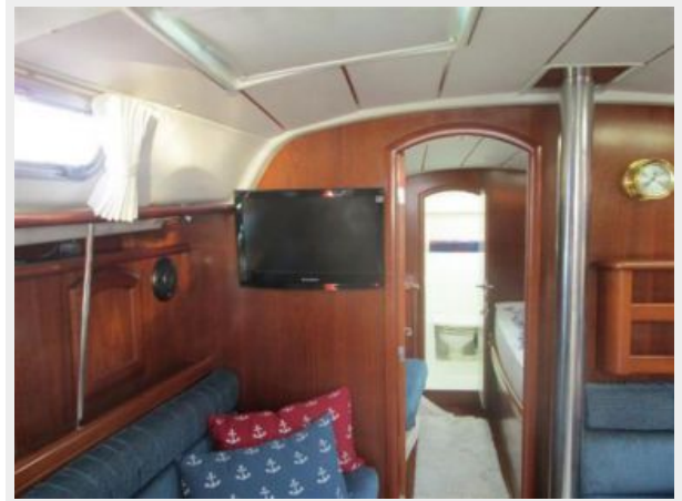
Salon looking forward