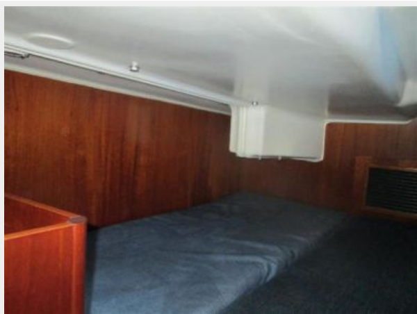
Aft Cabin Berth 2