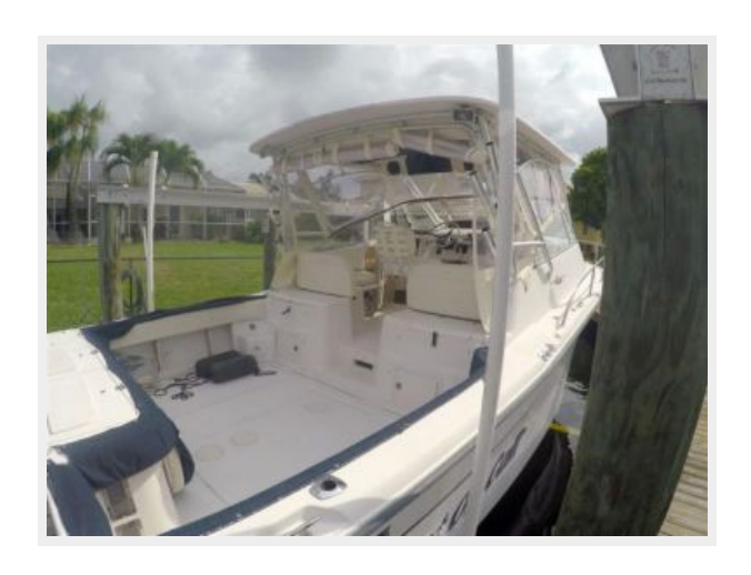
EZ Anchor Puller