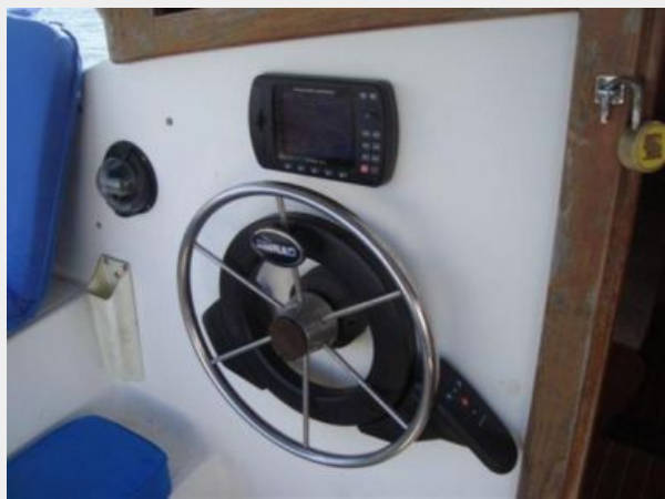
Helm Station - Simrad Auto Pilot with Standard Horizon GPS