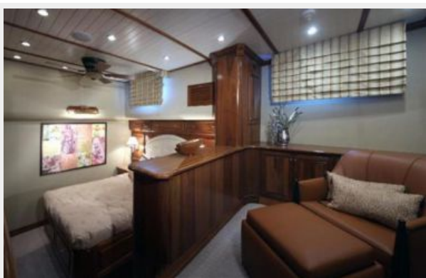
Split-level Master Suite (sister-ship)