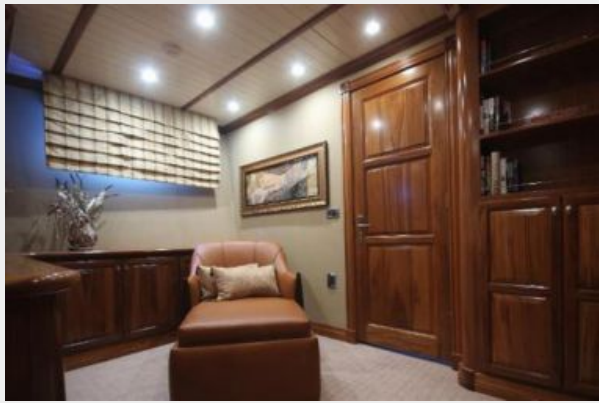
Master lounge area (sister-ship)