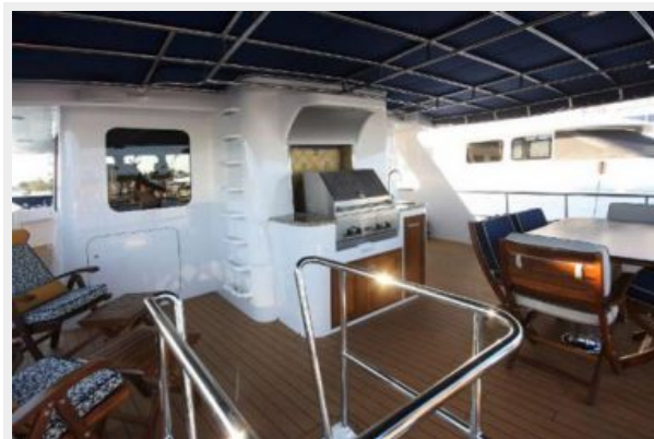
Wheelhouse Aft Deck (sister-ship)