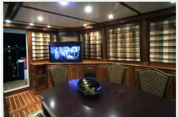
Salon looking aft (sister-ship)