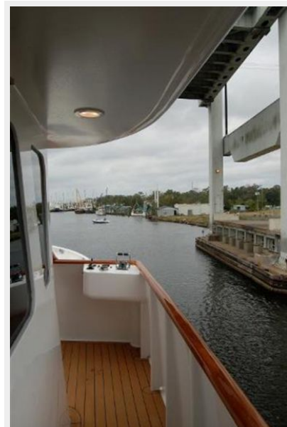
Wheelhouse side deck (sister-ship)