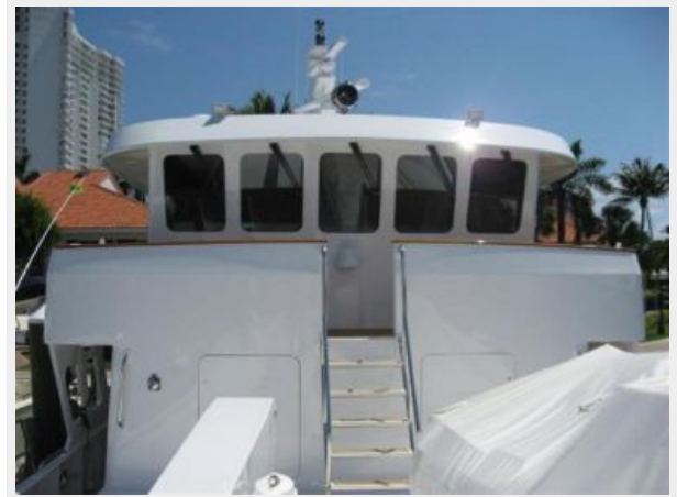
Wheelhouse side deck (sister-ship)