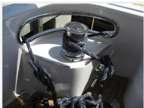
Warping Winch aft (sister-ship)