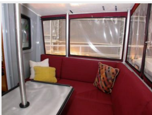
Enclosed aft deck