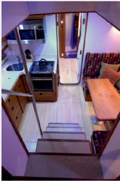
PH to Galley / Dining