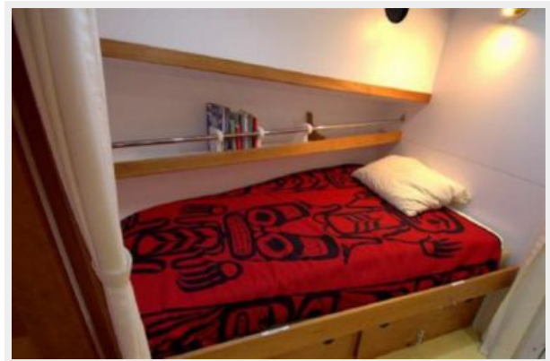
Guest Cabin lkg stbd