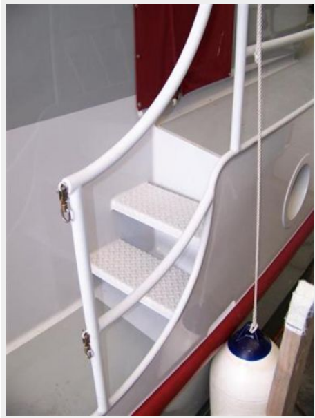
Side Deck detail