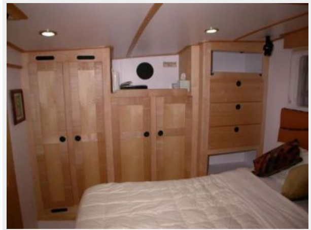
Master looking stbd