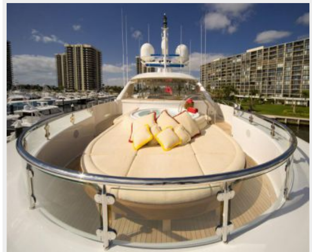
Top Deck 1