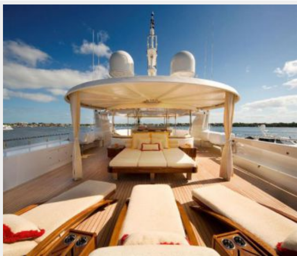
Top Deck 2