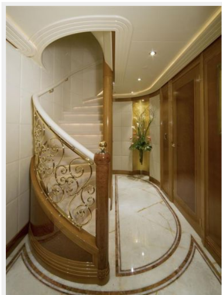
Middle Aft Deck