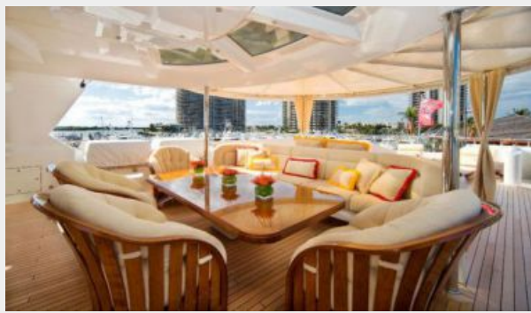
Main Aft Deck