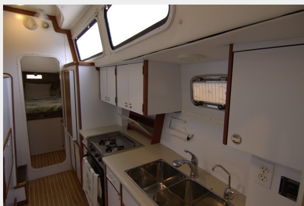
Galley Facing Aft