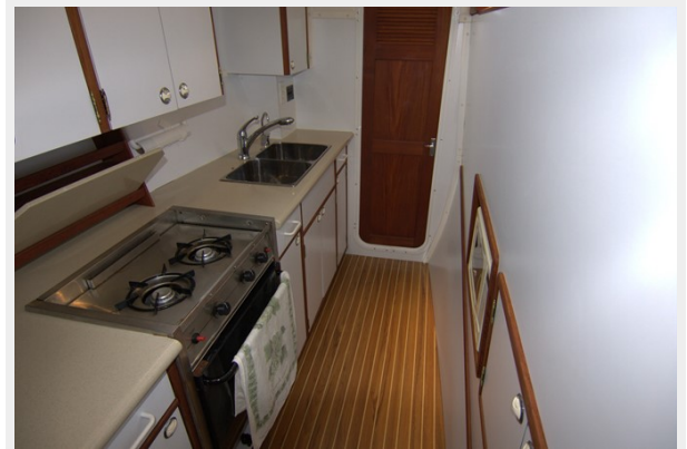
Galley Facing Forward