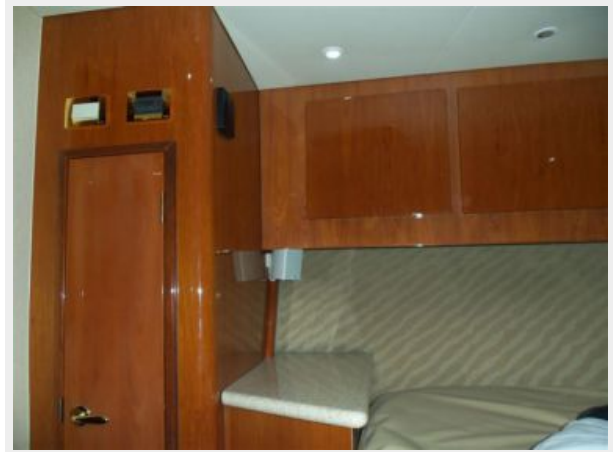
Stateroom to Port