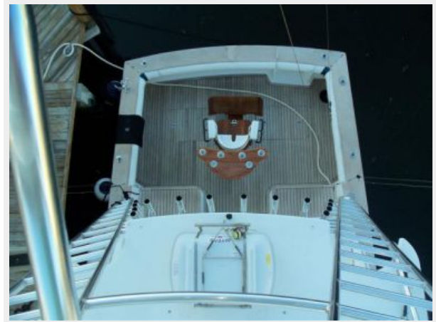
Cockpit From Above