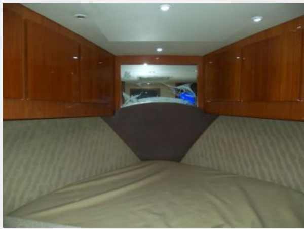
Stateroom Looking Forward