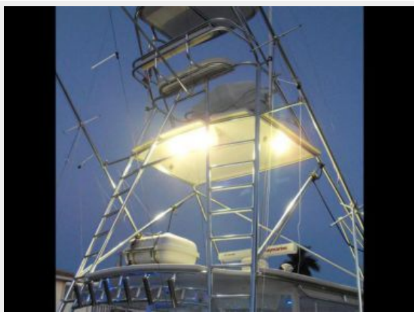
LED Spreader Lights