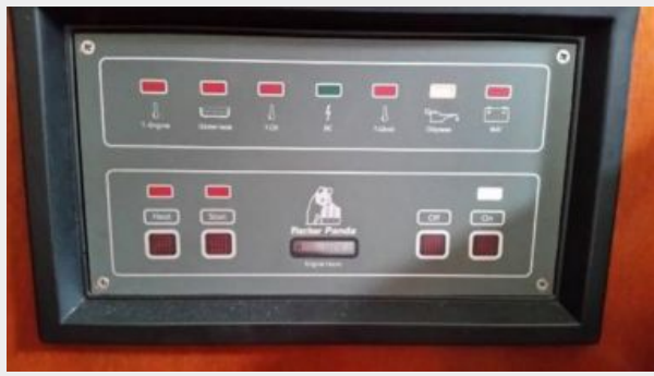
Generator Control Panel