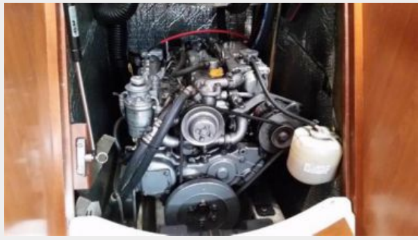
Yanmar 75 Diesel - (1968 hours)