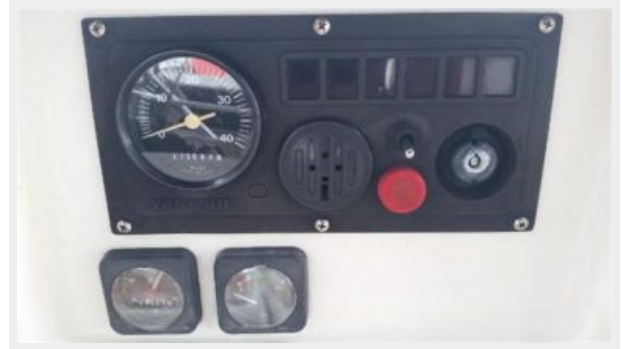
Engine Control Panel