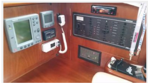
Nav Station 2