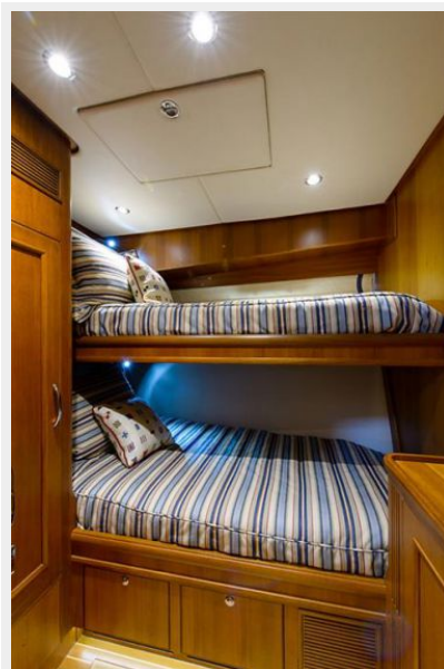
Guest Stateroom, Port