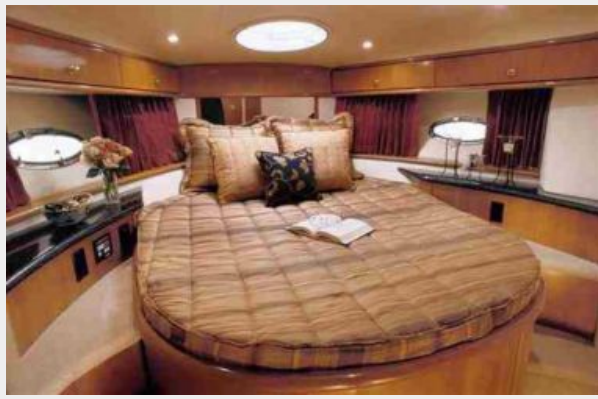
444 Cockpit Motor Yacht