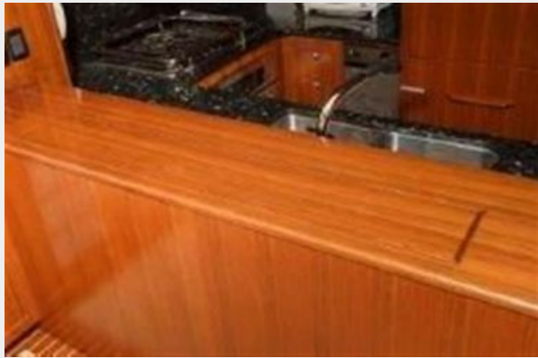
Saloon TV down