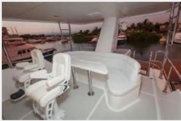
Fly Bridge aft