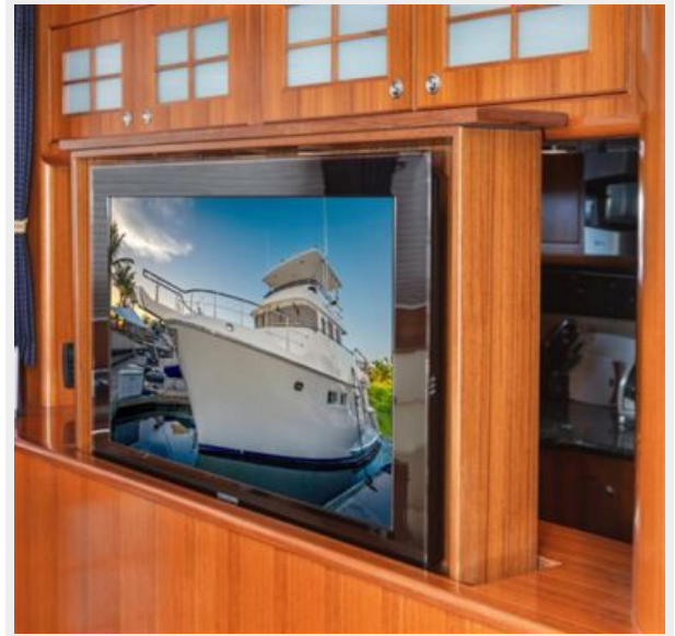
Pop up TV in Saloon