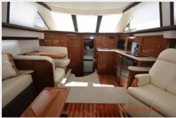
Galley starboard with dinette to port