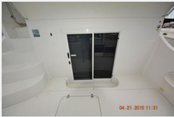
Master stateroom entrance from aft cockpit