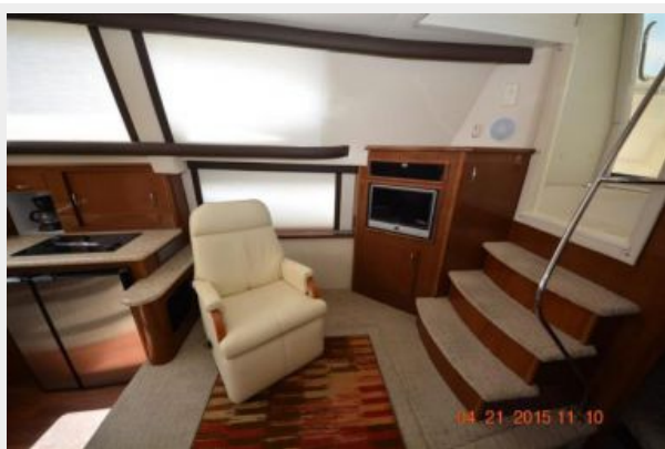
Salon starboard side with entertainment center