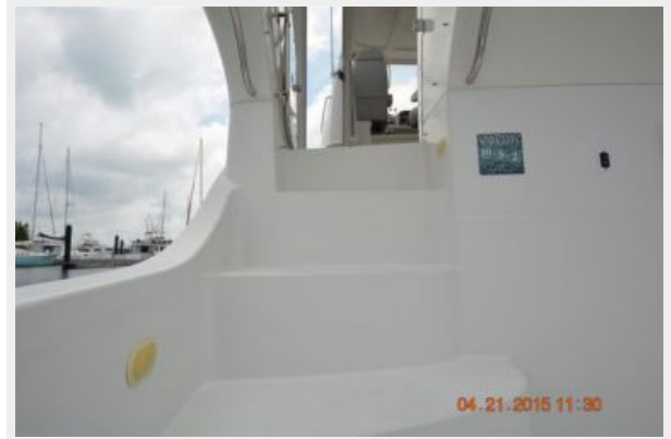
Entrance to flybridge