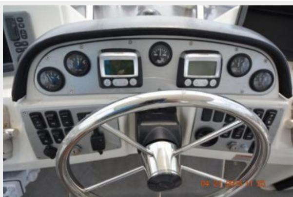
Helm station (Flybridge)