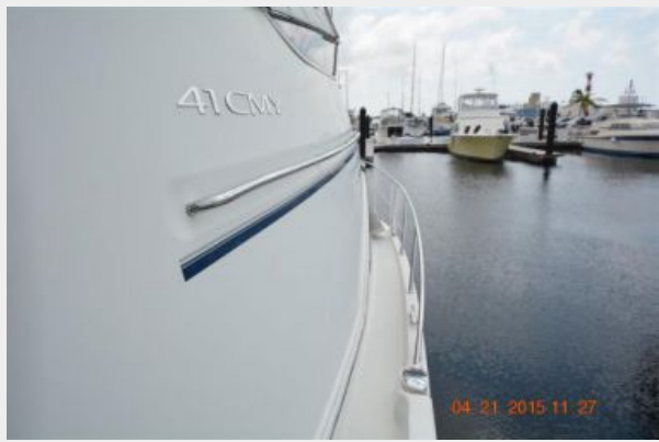
Starboard gunwale walk around