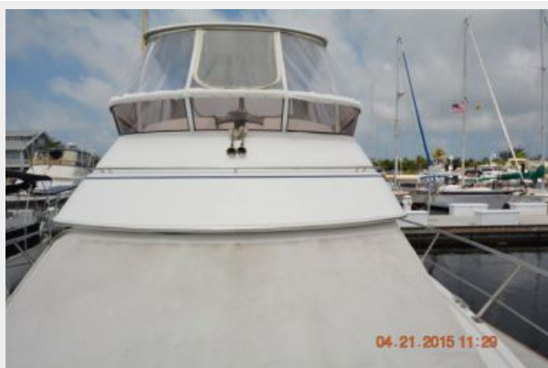
Bow facing aft