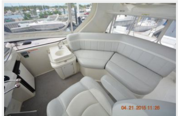
Cockpit seating and wet bar