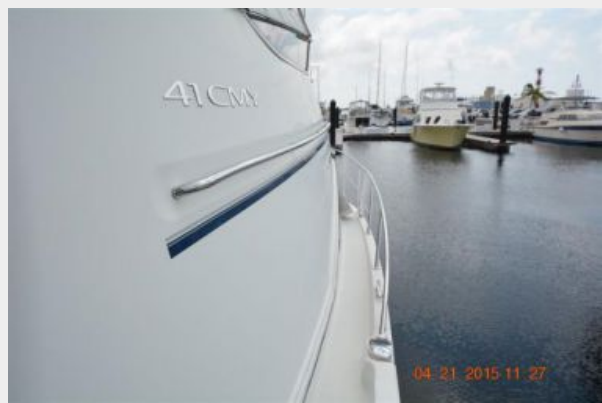
Starboard gunwale walk around