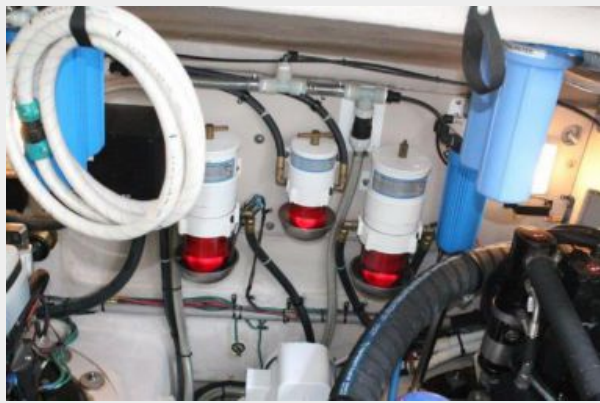
Racor Fuel Filters