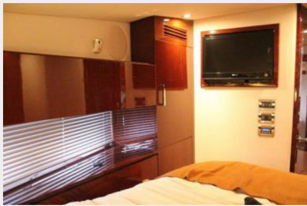
Master Stateroom TV