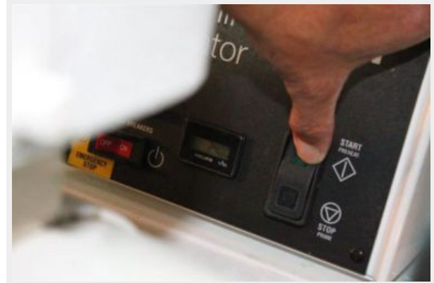
Generator Hours 4/30/15