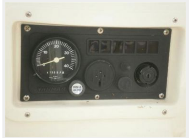
Engine Instruments & Warning Lights