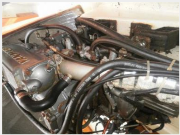
Yanmar 2GM Diesel (Top View)