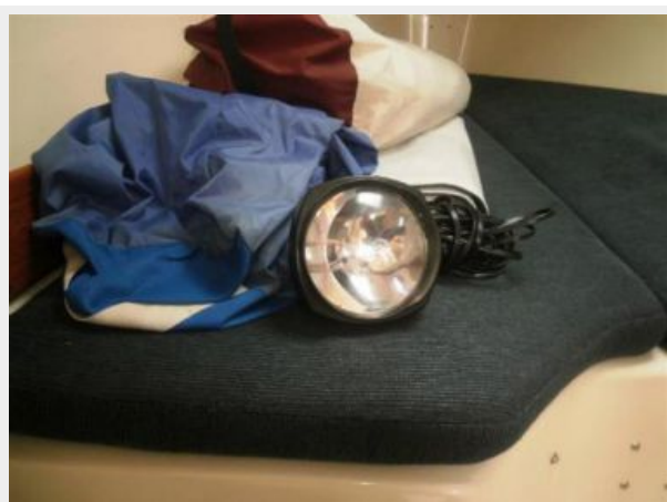
Main & Genoa plus 12Volt Spotlight