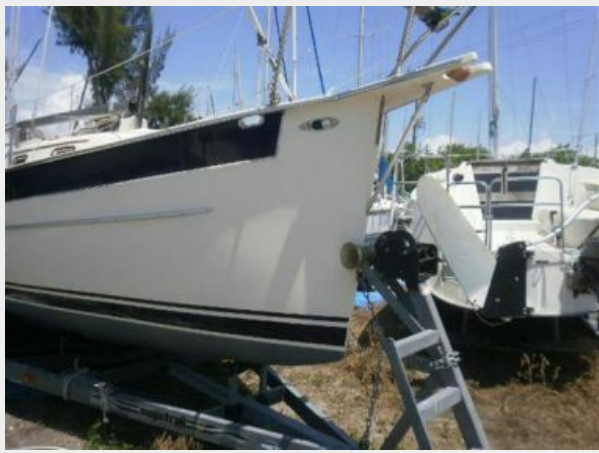
Bow Sprit & Trailer Steps