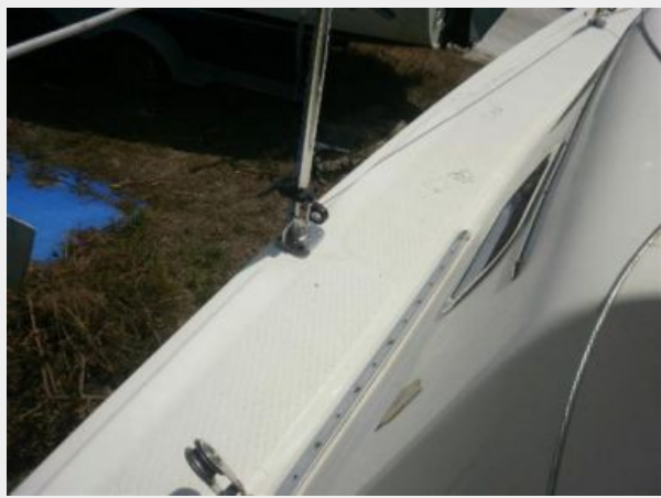
Standing Rigging is in excellent shape