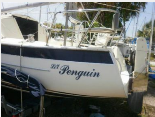
Lil Penguin w/Rudder in up position