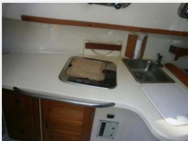
Cover on Stove trash holder under white cover