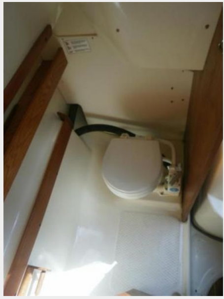
Stand up head with Holding Tank