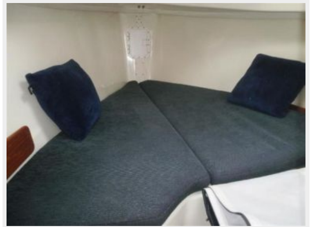
Forward "V" for a Double