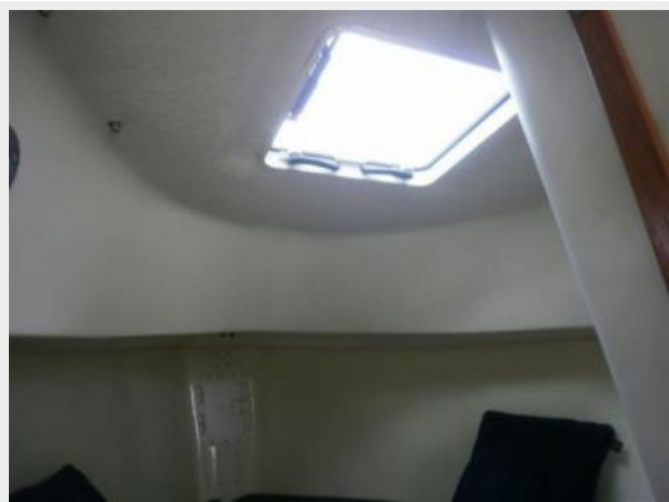
Overhead Hatch in Forward "V"