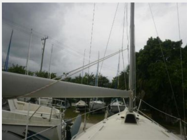
Boom w/Lazy Jacks