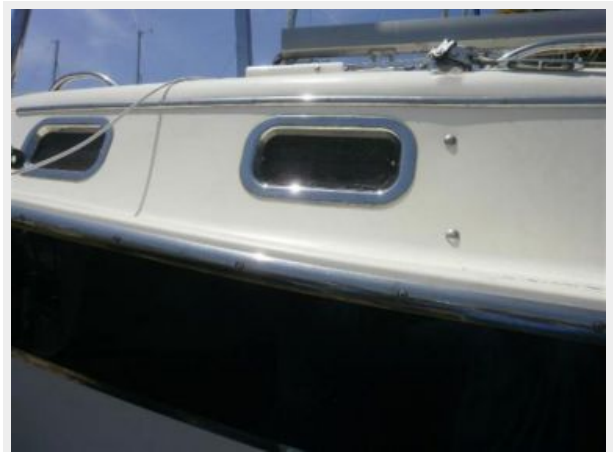
Stainless Steel Portholes