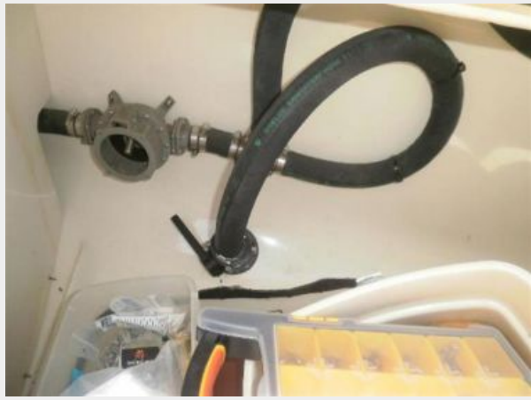
"Y" Valve for holding tank