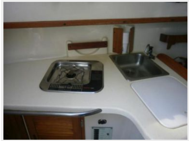
Origo 2000 Stove & Sink with hand pump