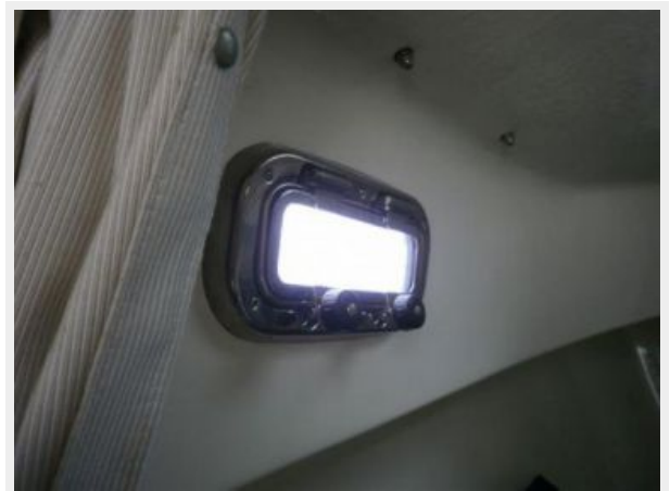
6 Stainless Steel opening ports