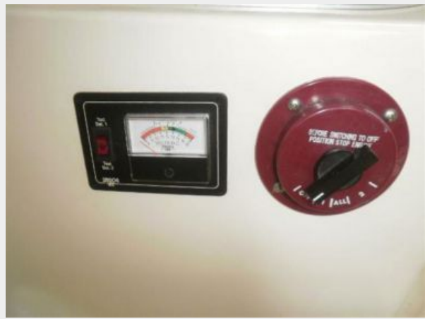
Battery Tester & A/B Selector