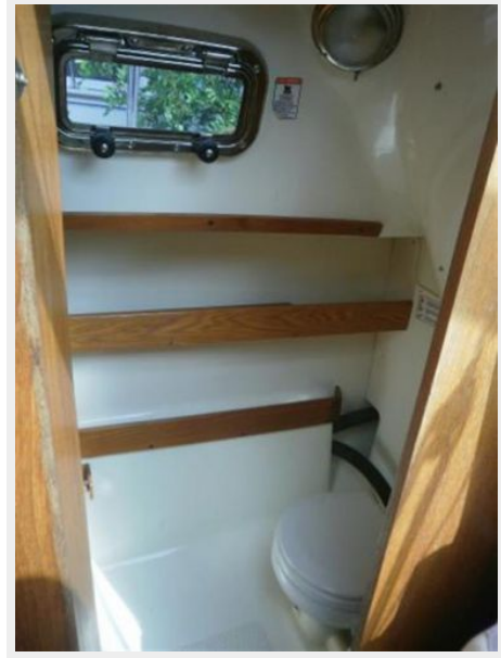
Port Hole plus solid door in head