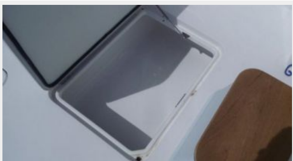
Cockpit / Fishing Equipment 5