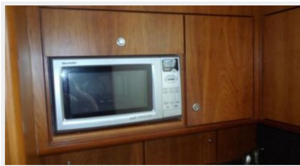
Galley 2 - Microwave Oven / Convection Oven