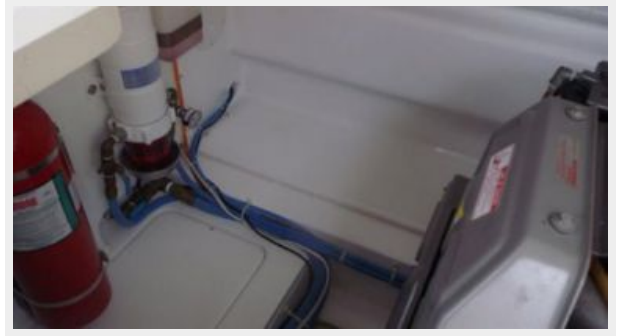
Engine & Mechanical Equipment 5