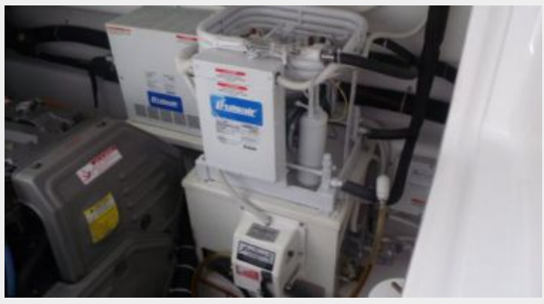
Engine & Mechanical Equipment 4