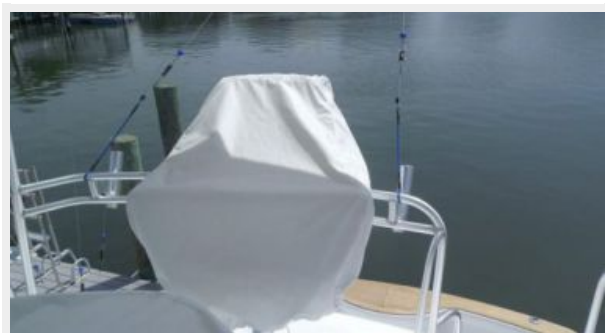
Helm / Electronics & Navigation 4