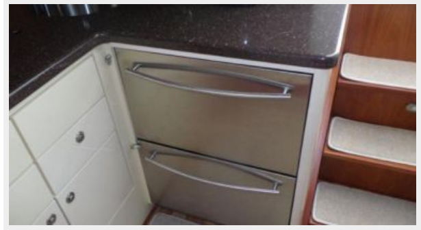
Galley 1 - Refrigerator & Freezer