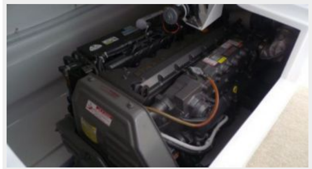
Engine & Mechanical Equipment 1