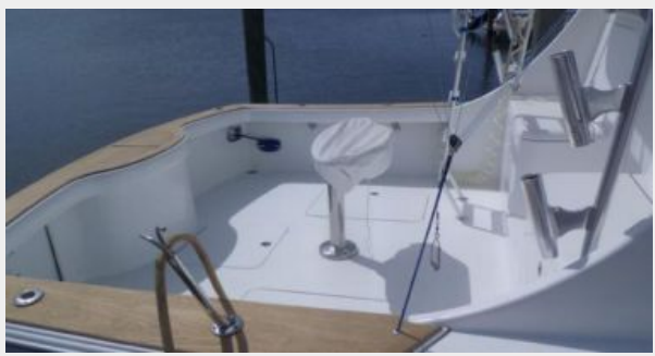
Cockpit / Fishing Equipment 1 - Cockpit