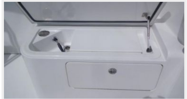
Cockpit / Fishing Equipment 2