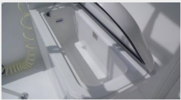
Cockpit / Fishing Equipment 3