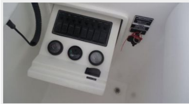
Helm / Electronics & Navigation 2