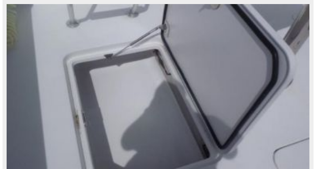
Cockpit / Fishing Equipment 4