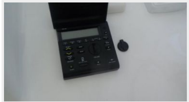
Helm / Electronics & Navigation 3