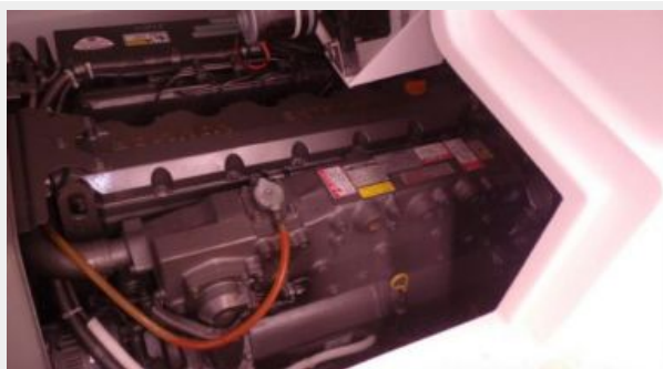
Engine & Mechanical Equipment 2