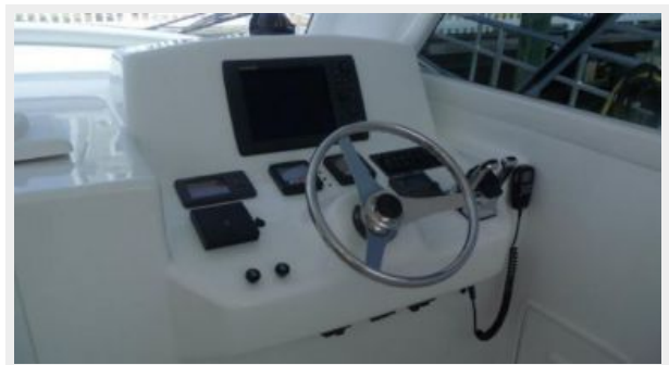
Helm / Electronics & Navigation 1