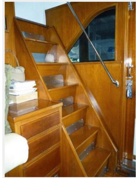
Pilothouse Staircase to Flybridge