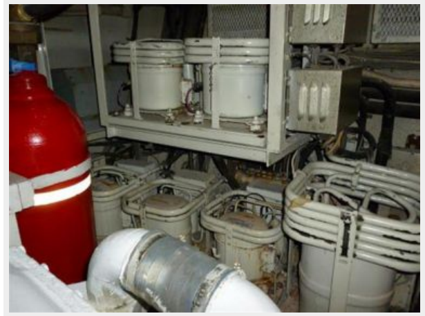
AC units in Engine Room