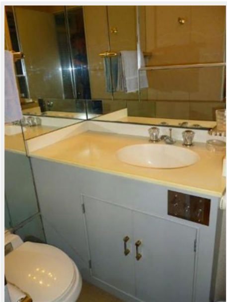
Port Guest Ensuite Head