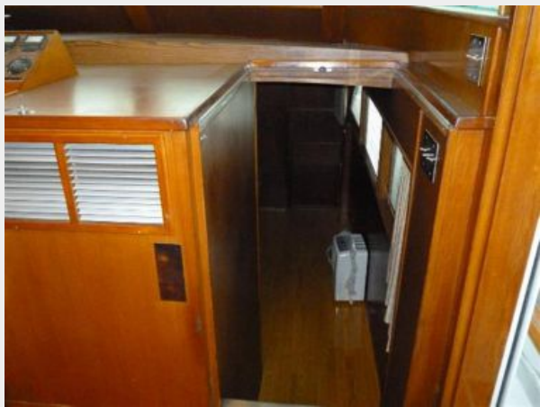
Access to Country Kitchen