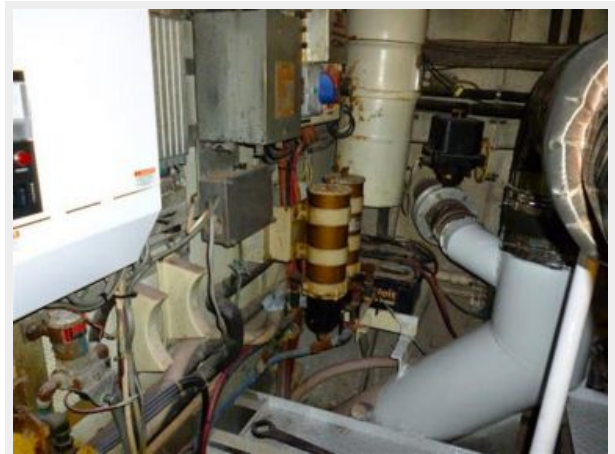
Engine Room - Electrical Panel