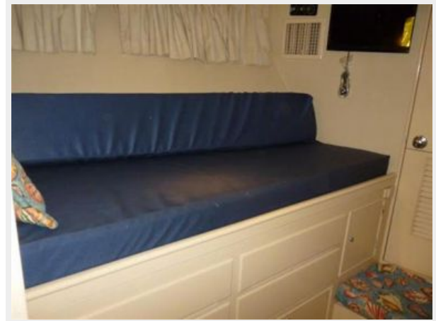
Single Crew Berth