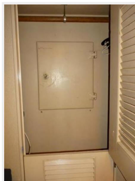
Forward Chain Locker