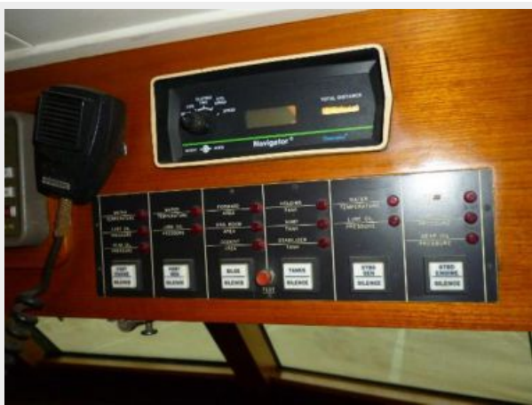
Pilothouse - Meters & Gauges