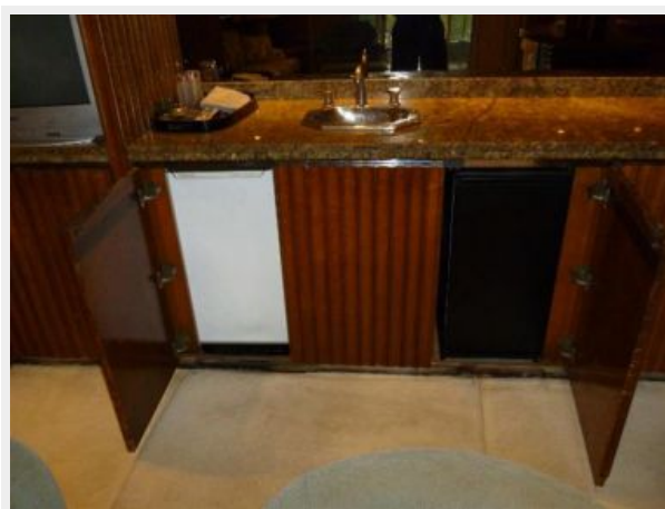
Salon Wet Bar, Refrigerator, & Ice Maker