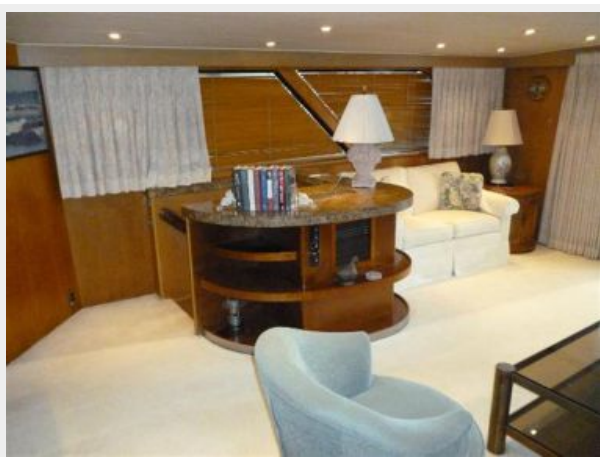
Salon & Accommodations Stairway Starboard Side