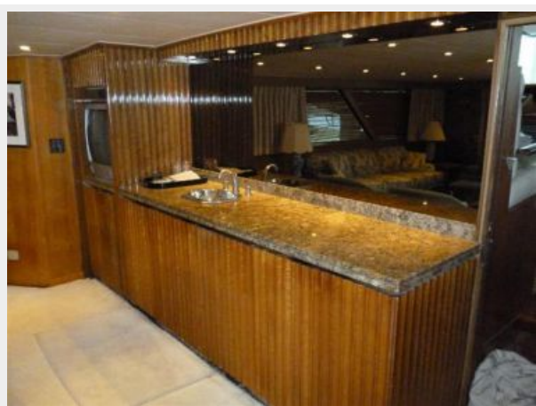
Salon Wet Bar & Entertainment Cabinet