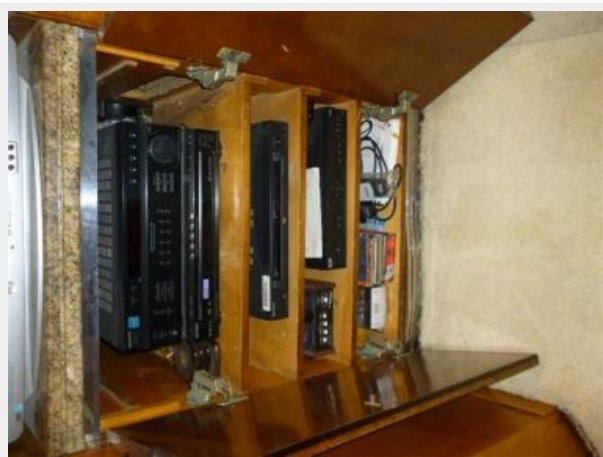
Salon Entertainment Cabinet