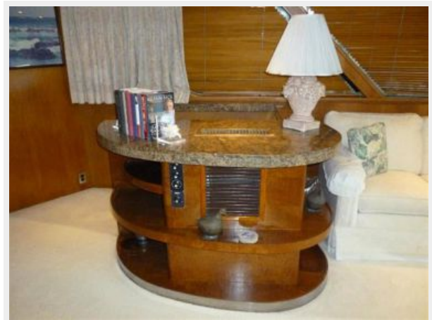
Salon Curio Shelf