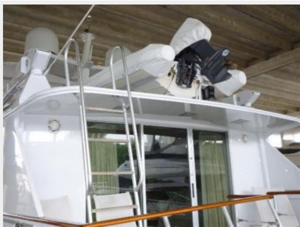
Aft access to Flybridge