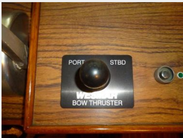
Pilothouse - Bow Thruster