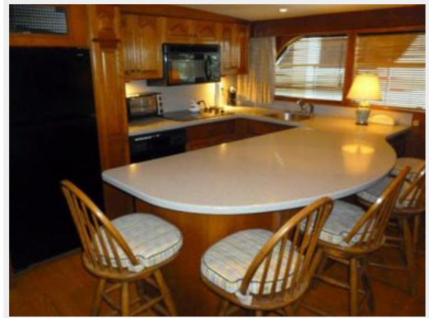
"Country Kitchen" Dining