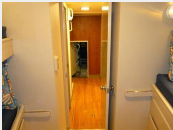
Access to Crew Mess Area