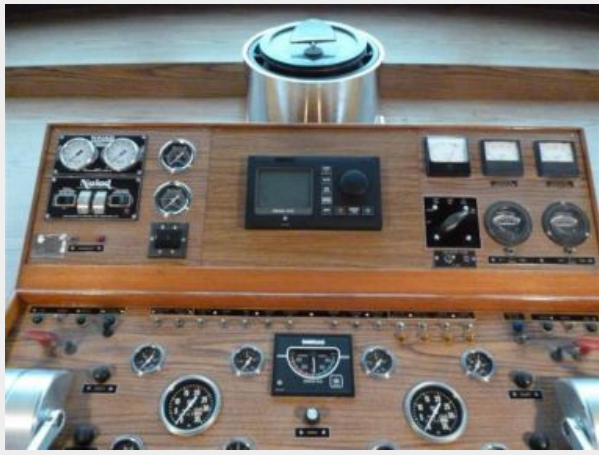
Pilothouse - Gauges