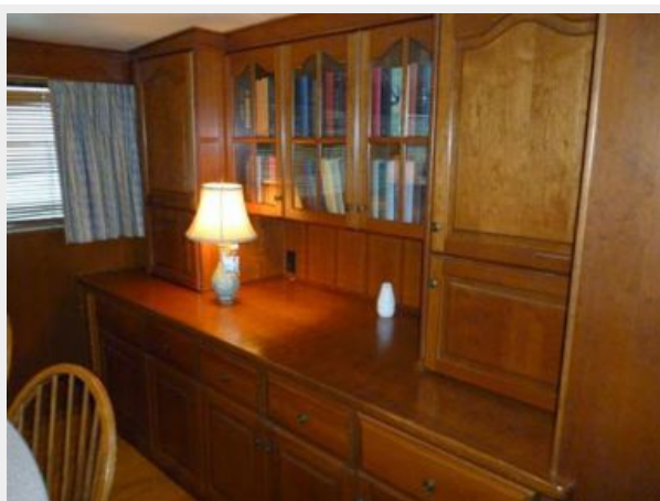
"Country Kitchen" Storage Hutch