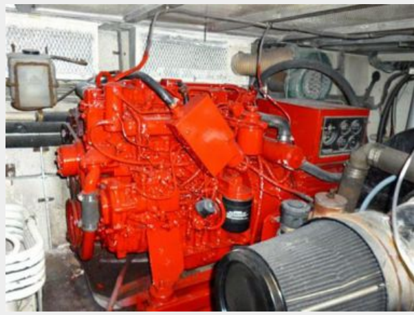
Generator in Engine Room