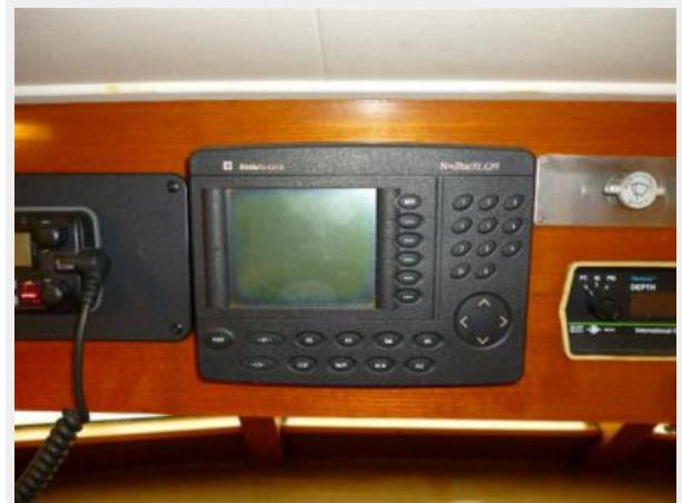
Pilothouse - Trimble NavTrac XL GPS