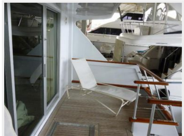
Aft Deck Lounger - Starboard