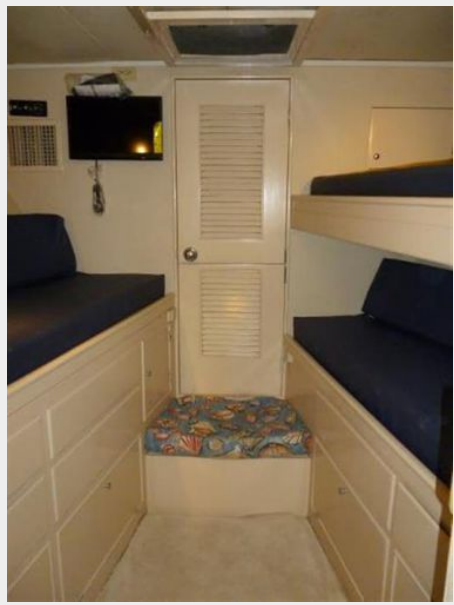
Crew Cabin looking Forward