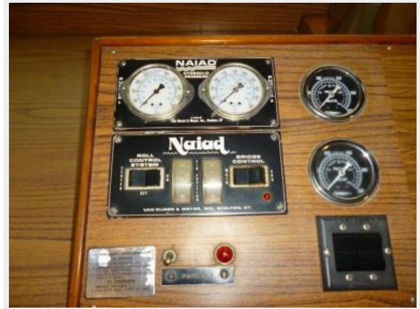
Pilothouse - Naiad Stabilizer Controls