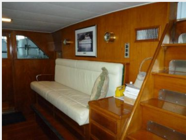
Pilothouse - Bench Seating