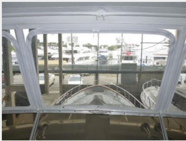
Flybridge - Forward Enclosure