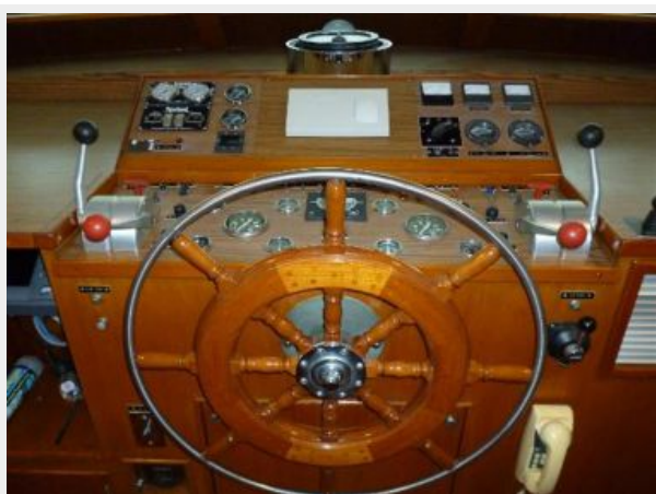
Pilothouse - Helm