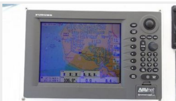
Bridge Furuno Navnet