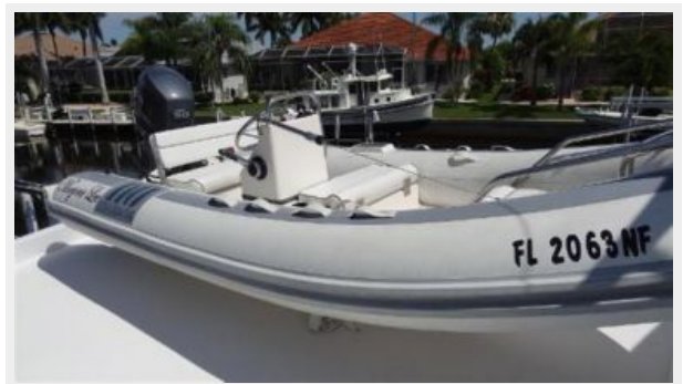
13' Novarania Tender