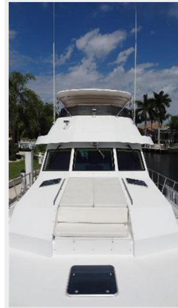
Bow Sunpads and seat