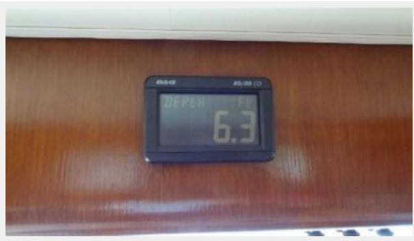
PH Depth Finder