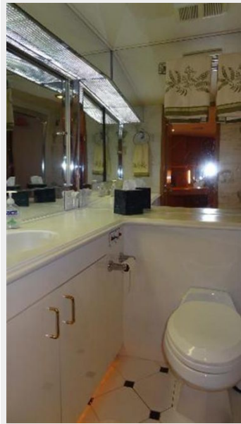
Master Cabin Head Starboard