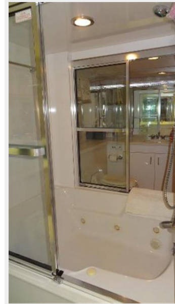
Master Cabin Head Port