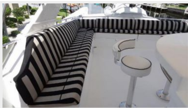
Bridge Aft Seating