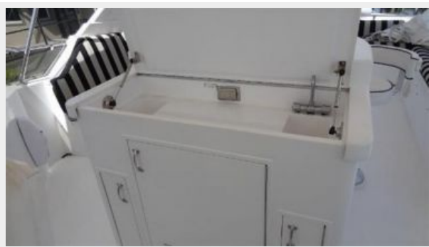
Bridge Wet Bar w/refrigerator