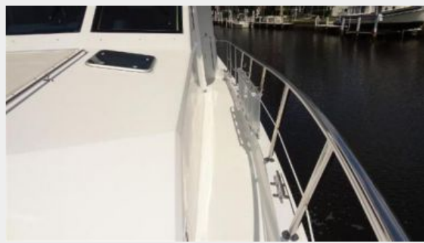
Port side boarding ladder