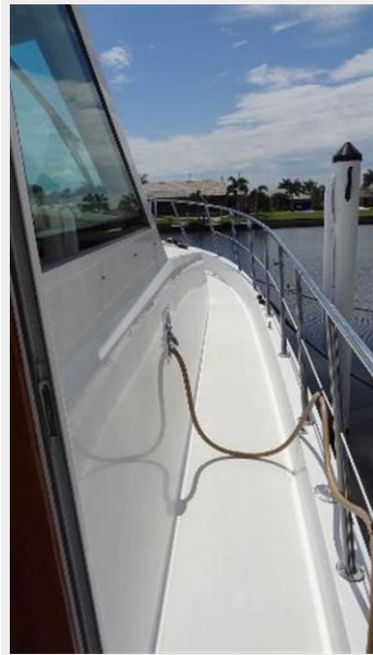
Starboard side bow access