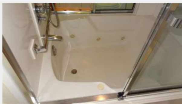
Master Cabin Tub/Shower