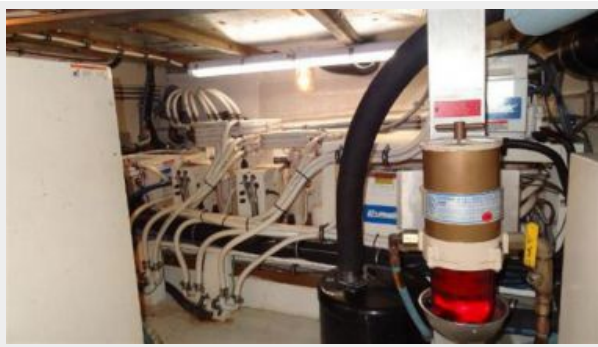
7 AC Units