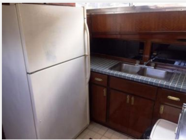
Galley with full size refrigerator & Freezer