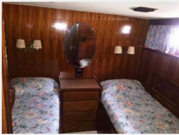
Aft Guest Stateroom