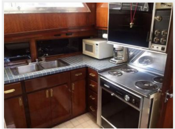
Galley double sink and stove with oven