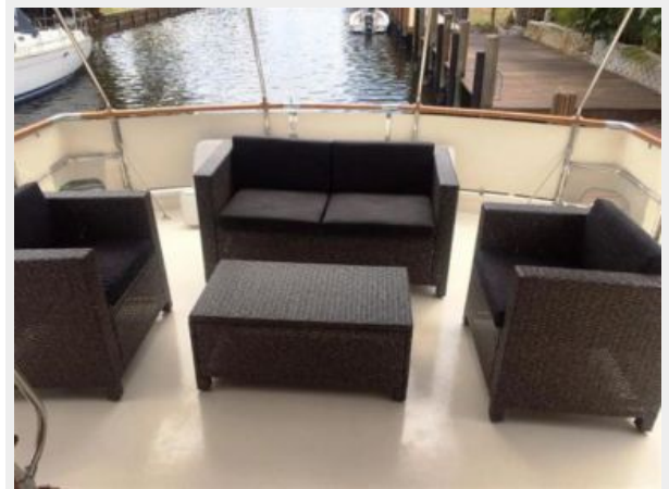
Salon aft deck area