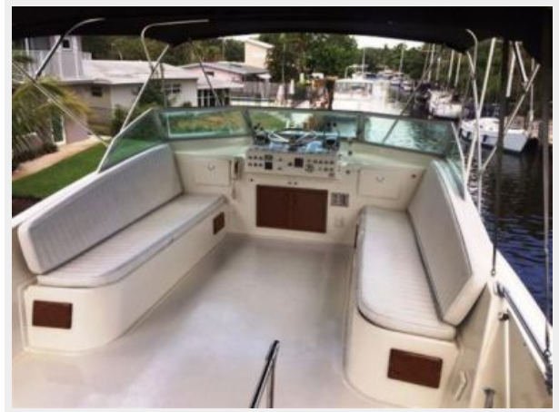
Upper Helm and seating