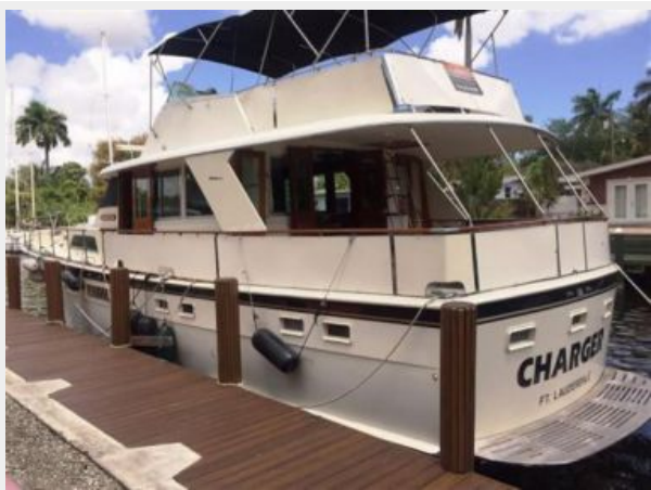
Port mid boat