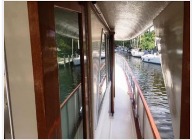
Starboard covered walkway