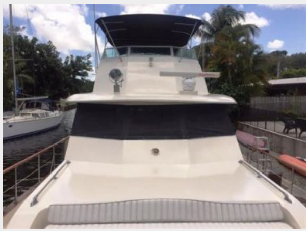
Fore-deck Seating and Bridge Bimini