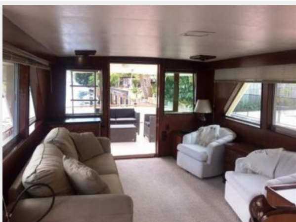
Salon looking aft