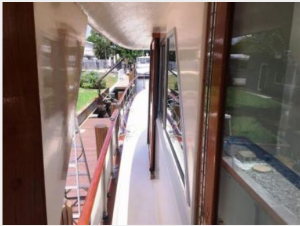
Port covered walkway