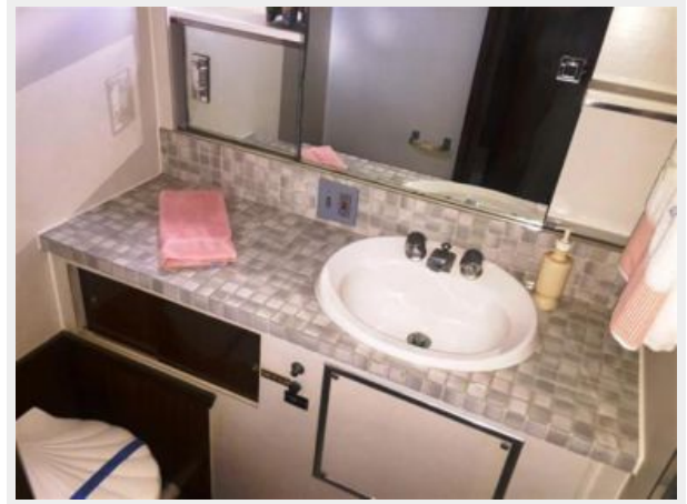
Aft Guest head