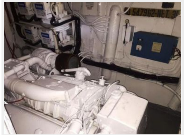
Port engine room