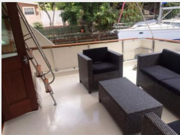
Salon aft deck and staircase to Bridge