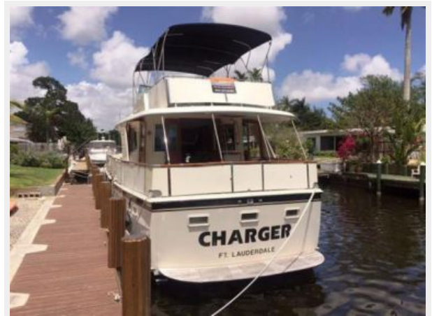
Port Stern view