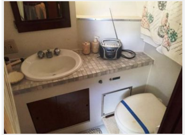
V-berth cabin head