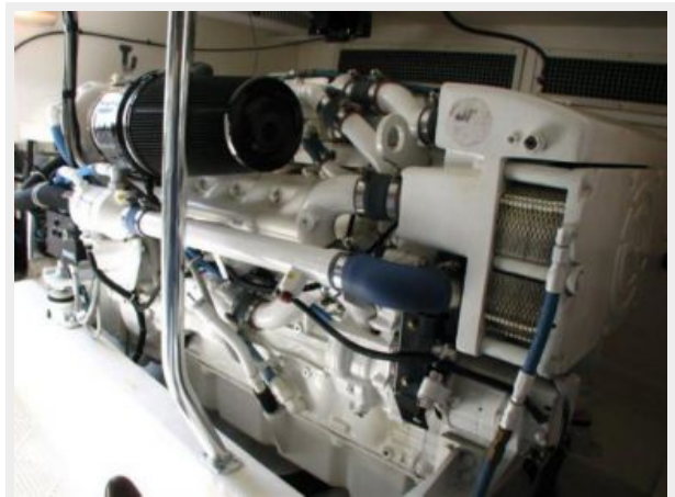
Engine & Mechanical Equipment 2 - Port Engine