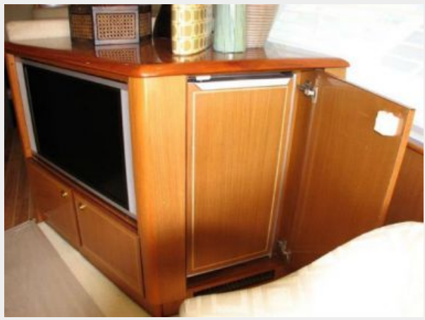
Salon 8 - Ice Maker