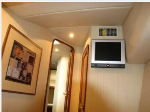
Guest Stateroom, Starboard 3 - TV