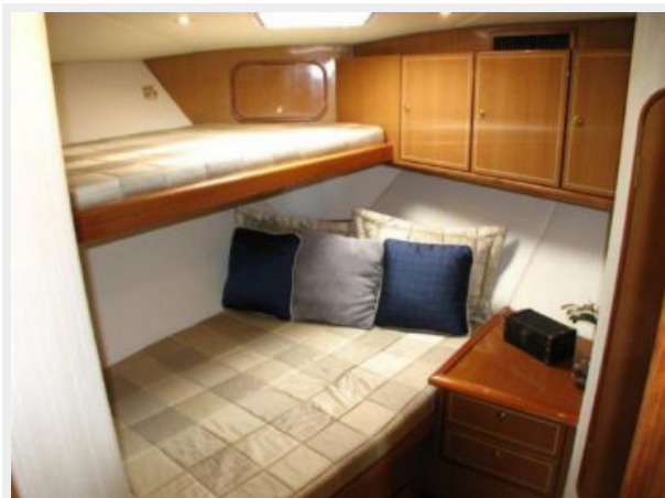
Guest Stateroom, Forward 1