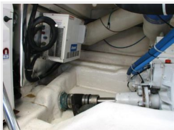
Engine & Mechanical Equipment 9