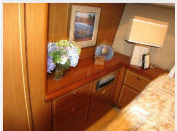
Master Stateroom 2