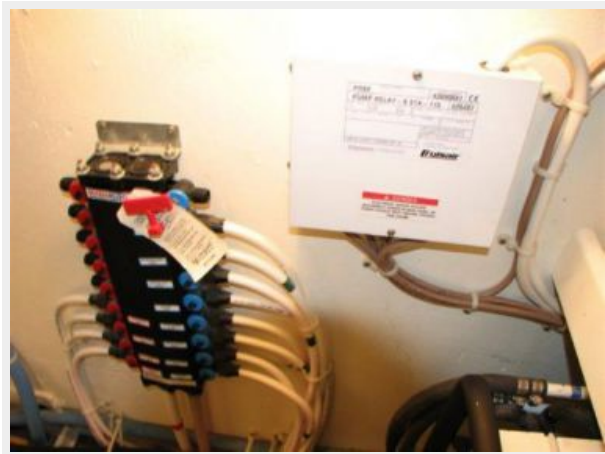
Engine & Mechanical Equipment 7