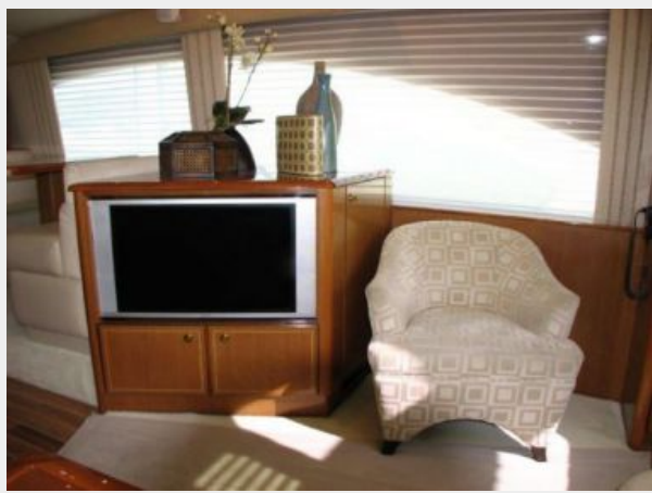
Salon 6 - TV