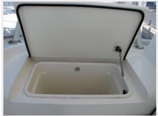
Deck 4 - Bridge Storage