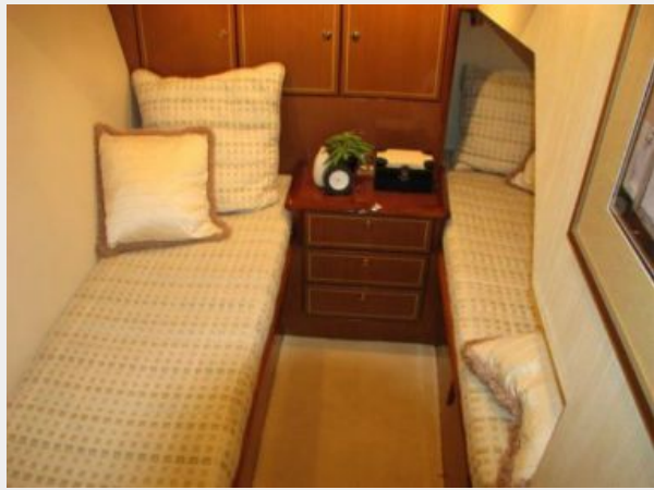
Guest Stateroom, Starboard 1