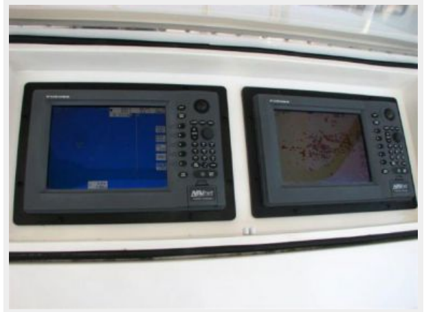
Helm / Electronics & Navigation 5 - Starboard Radio Box