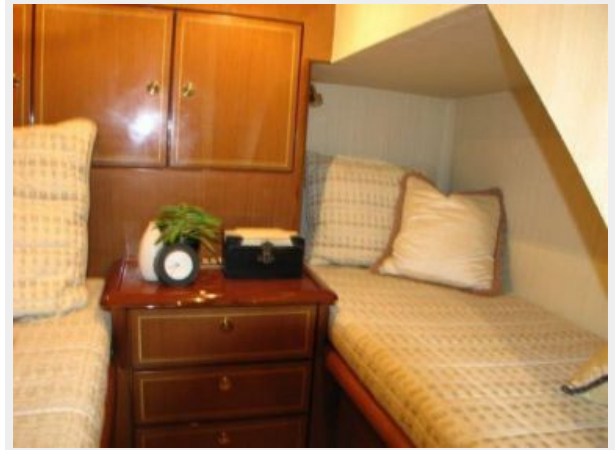
Guest Stateroom, Starboard 2