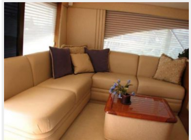
Salon 1 - Sofa & Cocktail Table