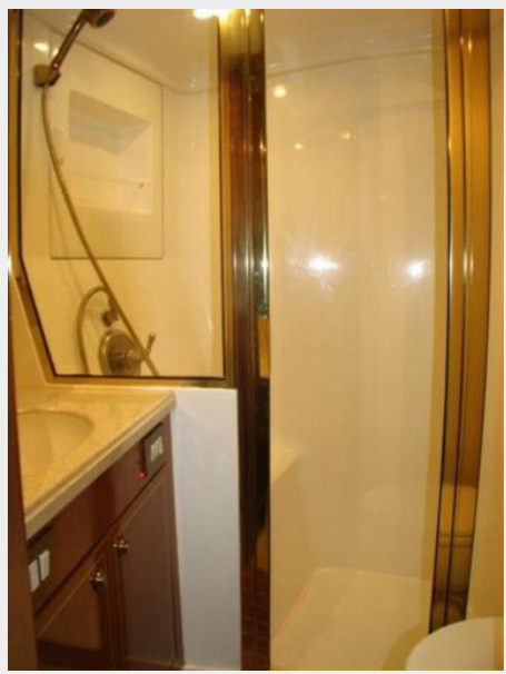
Master Head 2 - Shower