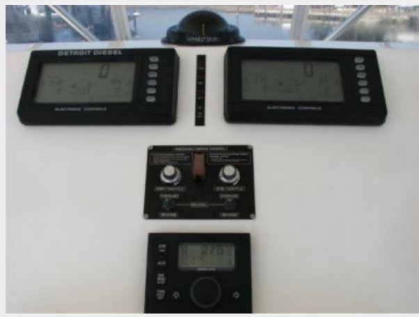
Helm / Electronics & Navigation 4