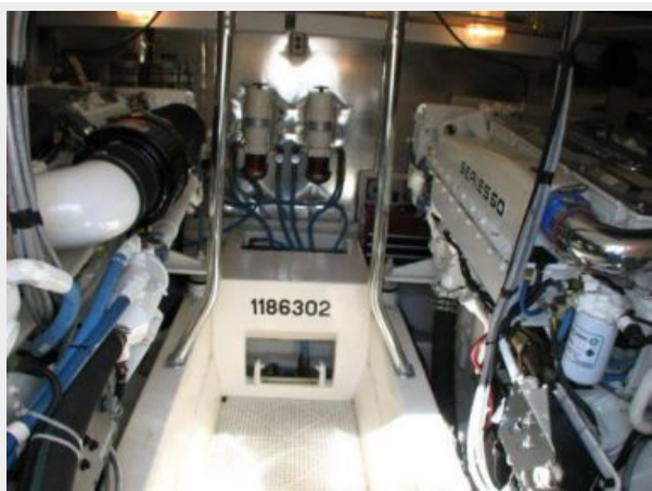
Engine & Mechanical Equipment 1 - Engine Room