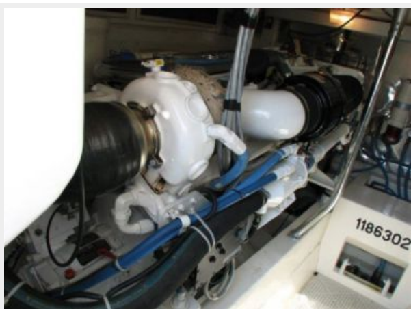
Engine & Mechanical Equipment 3 - Port Engine