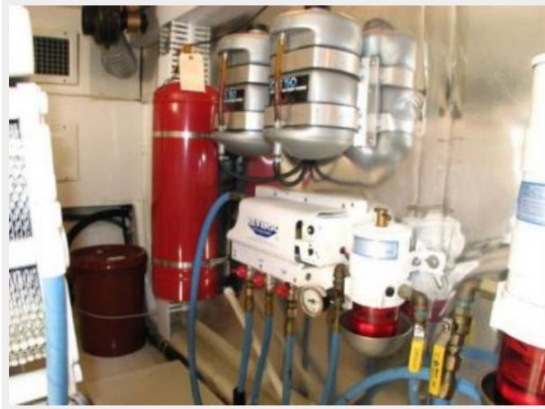
Engine & Mechanical Equipment 5