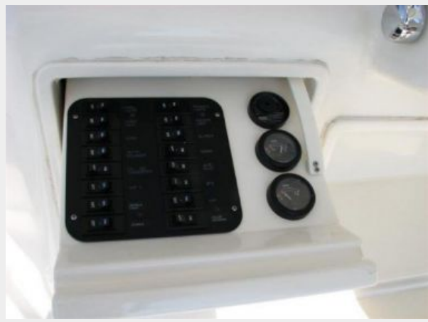
Helm / Electronics & Navigation 6