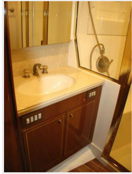
Master Head 1