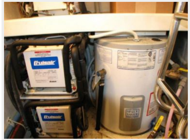
Engine & Mechanical Equipment 6 - Cruisair