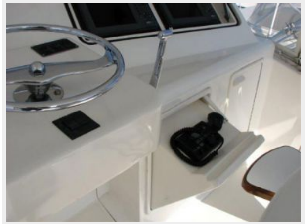
Helm / Electronics & Navigation 7