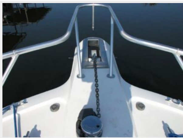
Deck 1 - Windlass