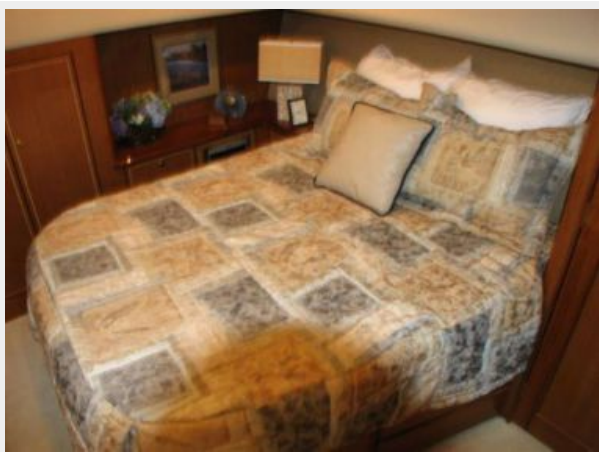
Master Stateroom 1