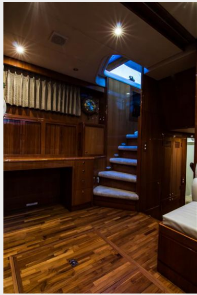
Companionway to Pilothouse