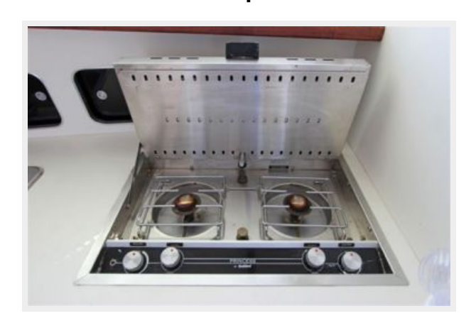
Princess 2-Burner Electric/Alcohol Stove Top