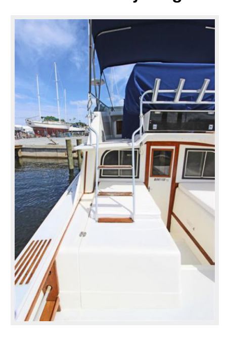
Ladder to Flybridge