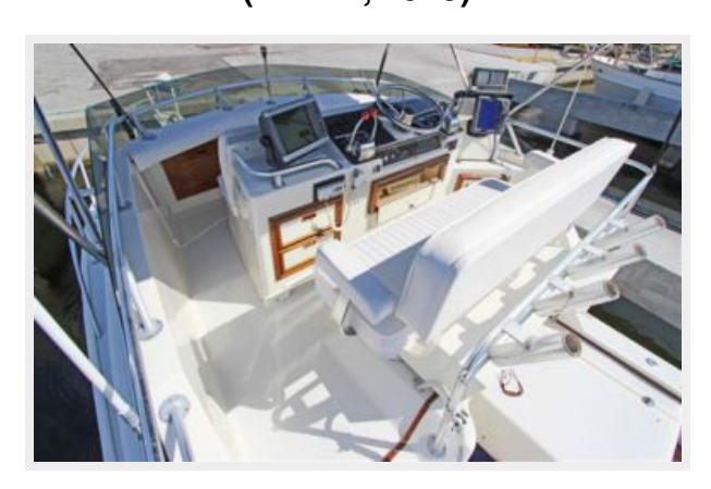
Flybridge Helm Station w/NEW SEAT! (APRIL, 2015)