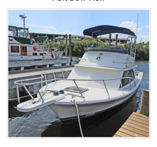
Port Bow View