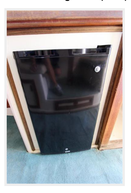
NEW GE Refrigerator (2015)