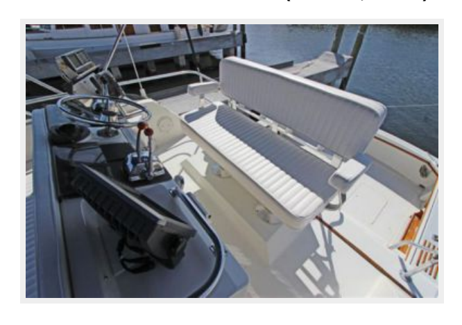
New Helm Station Seat (APRIL, 2015)