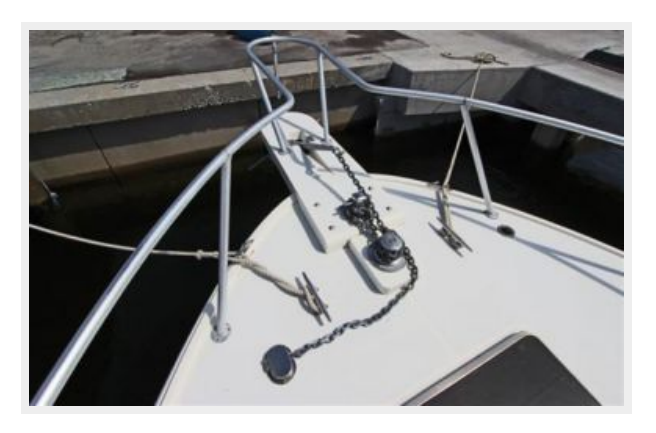
Bow Pulpit Windlass, Anchor, Rode