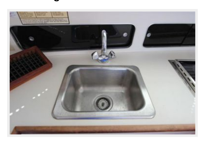
Single Stainless Steel Sink