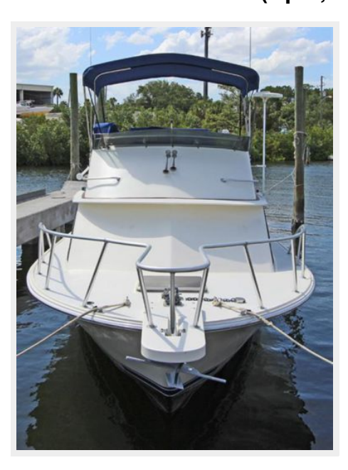
Bow View with NEW Bimini (April, 2015)