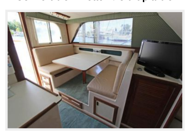
Convertible Dinette w/fold-up table