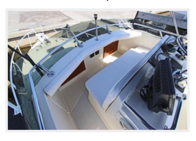
Companion Seating Forward of Helm-NEW SEAT UPHOLSTERY & BOLSTER! (APRIL, 2015)