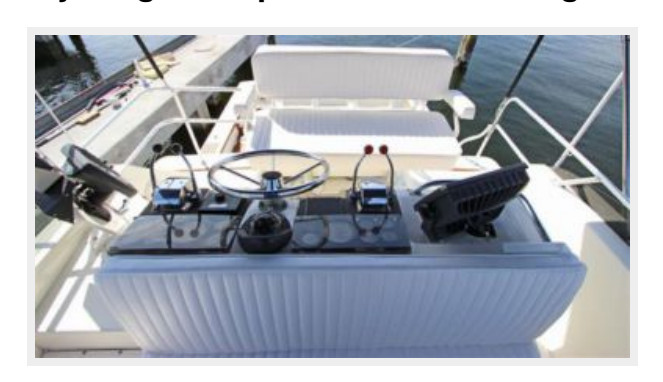
Flybridge Companion Seat Looking Aft