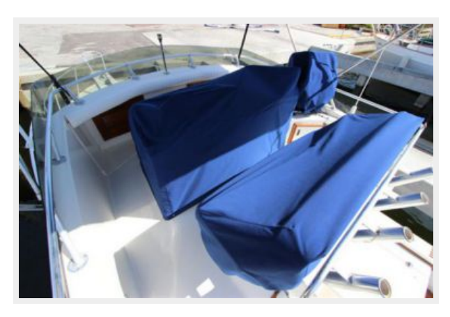
NEW Sunbrella Canvas Covers (APRIL, 2015)