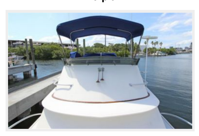
Wide Port & Starboard Side Decks for going forward