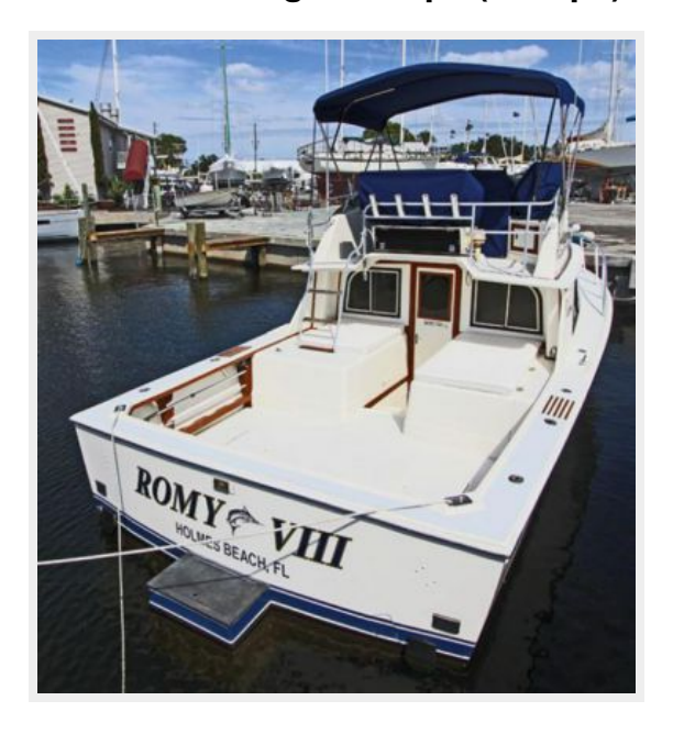
Stern and Large Cockpit (71 sq.ft)