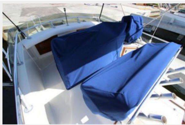
NEW Sunbrella Canvas Covers (APRIL, 2015)