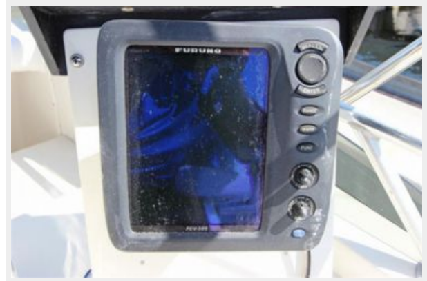
Furuno FCV-585 Color Depth Sounder (NEW 2007)