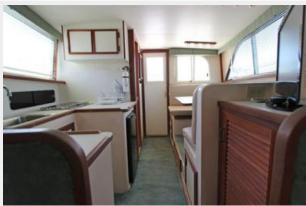
Forward V-Berth looking Aft to Entry Door