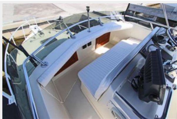
Companion Seating Forward of Helm-NEW SEAT UPHOLSTERY & BOLSTER! (APRIL, 2015)