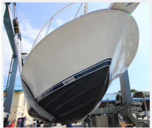
Bow View at Haulout- Boat has been totally Detailed Exterior & Interior