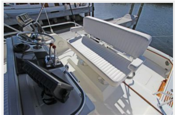
New Helm Station Seat (APRIL, 2015)