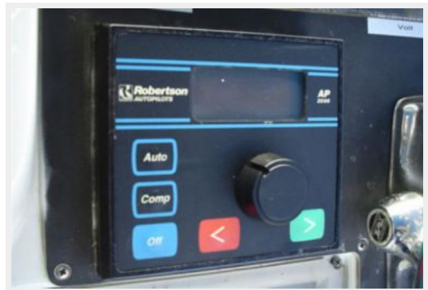
Robertson AP2500 AutoPilot