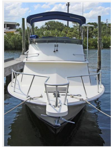
Bow View with NEW Bimini (April, 2015)