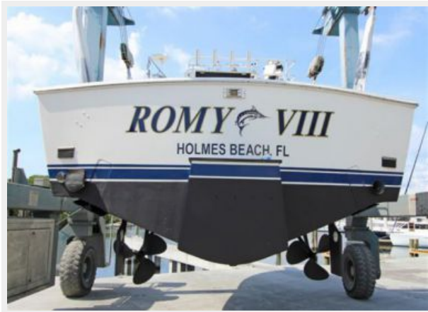
Stern at Haulout-NEW BOTTOM PAINT (APRIL, 2015)