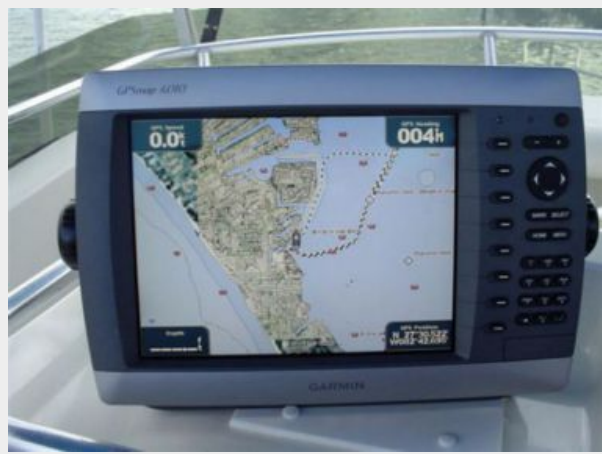
Garmin 4010 Plotter/Sounder