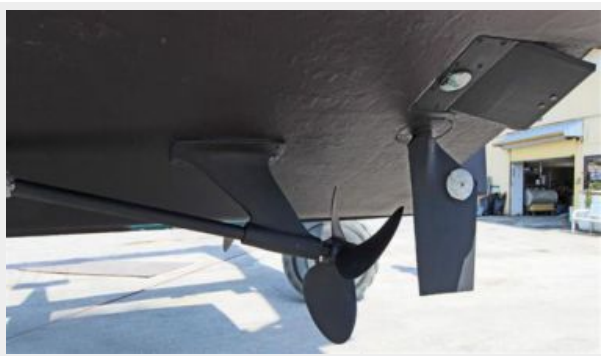
Port Rudder & Shaft-NEW Zincs(APRIL, 2015)