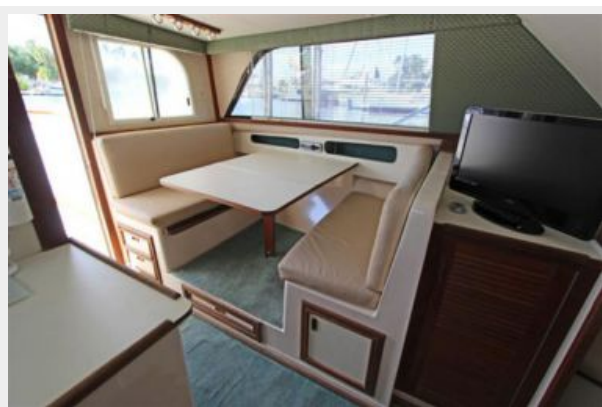
Convertible Dinette w/fold-up table