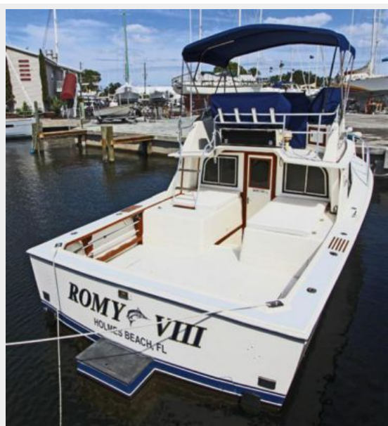
Stern and Large Cockpit (71 sq.ft)