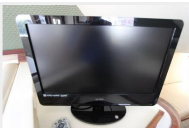
Vizio HD Flat Screen TV (NEW)