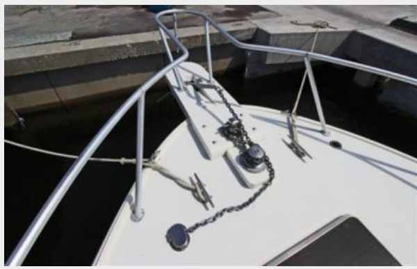
Bow Pulpit Windlass, Anchor, Rode