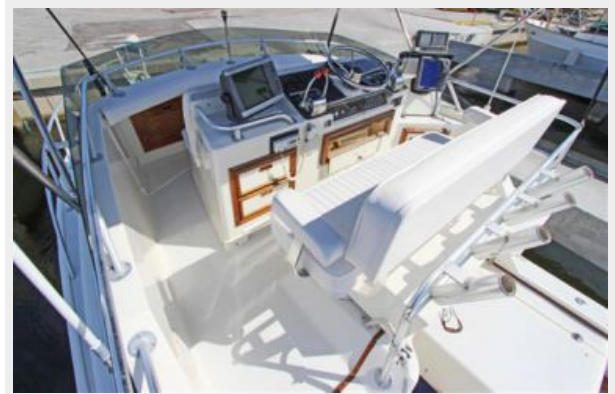
Flybridge Helm Station w/NEW SEAT! (APRIL, 2015)