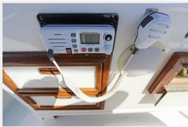
Standard Horizon Eclipse DSC VHF (NEW 2009)