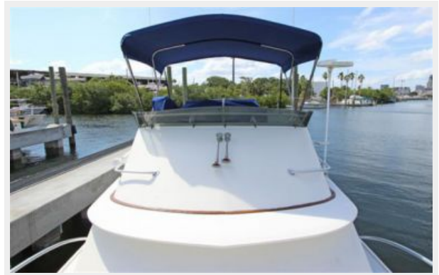
NEW Sunbrella Bimini & View from Bow Pulpit