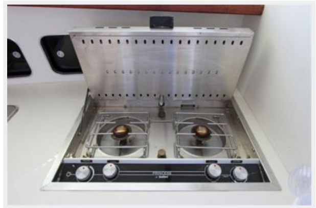
Princess 2-Burner Electric/Alcohol Stove Top