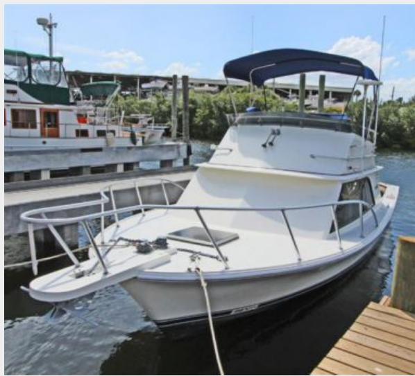
Port Bow View