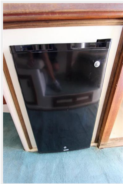
NEW GE Refrigerator (2015)