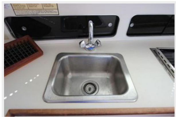
Single Stainless Steel Sink