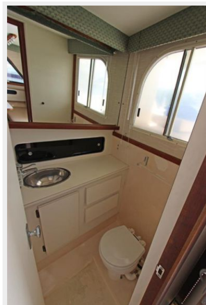
Head w/NEW Electric Toilet, Sink & Vanity