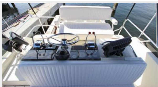
Flybridge Companion Seat Looking Aft