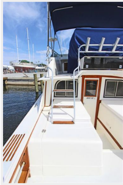
Ladder to Flybridge