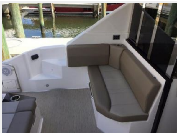
Aft Deck Seating 2