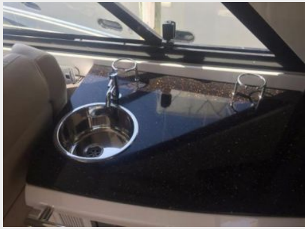
Bar Upper Salon