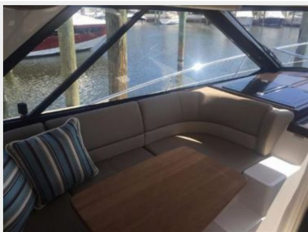
Upper Salon Seating