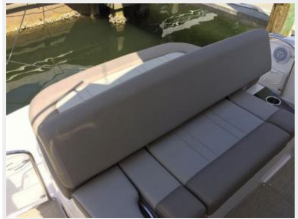
Aft Deck Seating/Sunpad