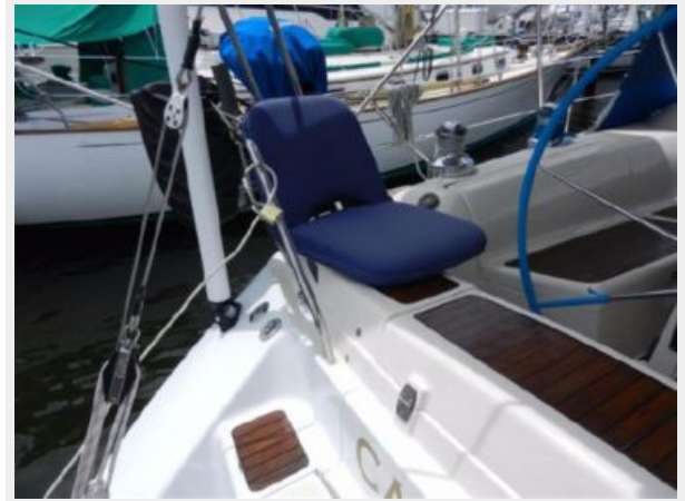
The drivers seat!