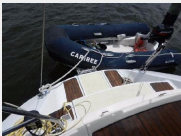
Swim steps and dingy