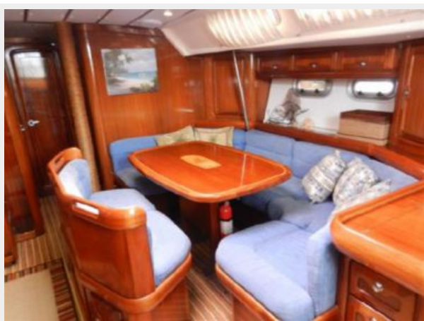
Large settee and dining area