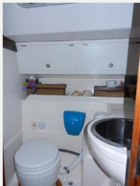
Private aft head 2