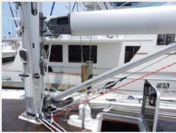
Mast base and boom vang