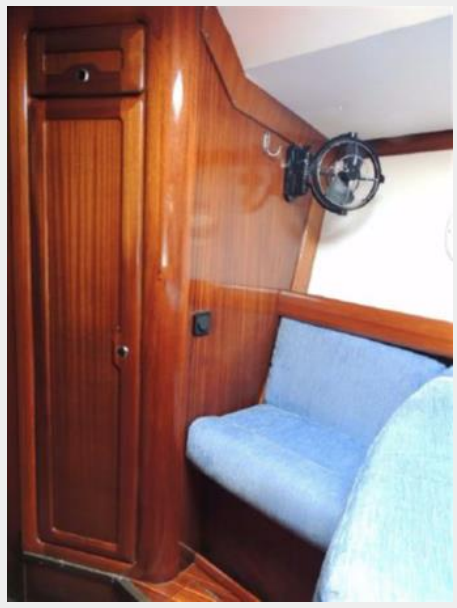
Side seat and hanging locker