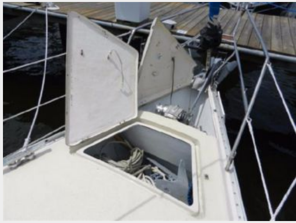
Anchor and windlass lockers