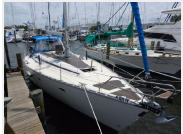
Swiveling nav pod and destroyer wheel