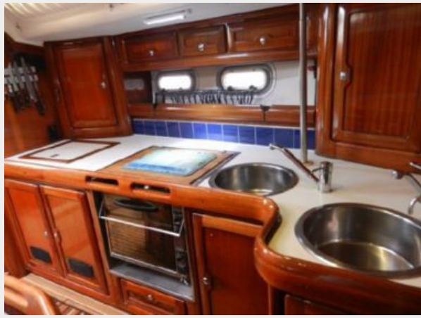
Galley view looking aft