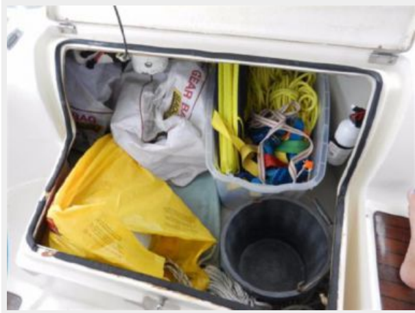
Huge lazarette storage