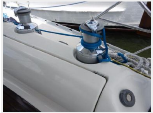
Electric primary winches