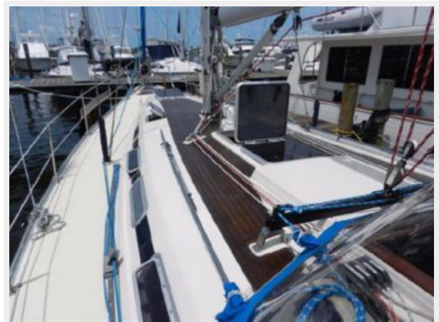
Wide side decks