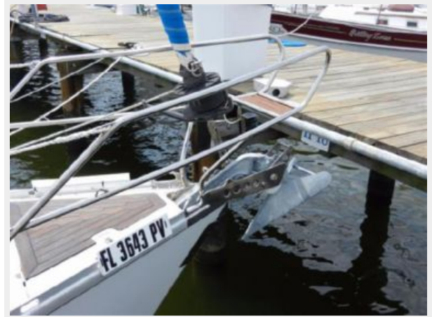
Bow roller and anchor