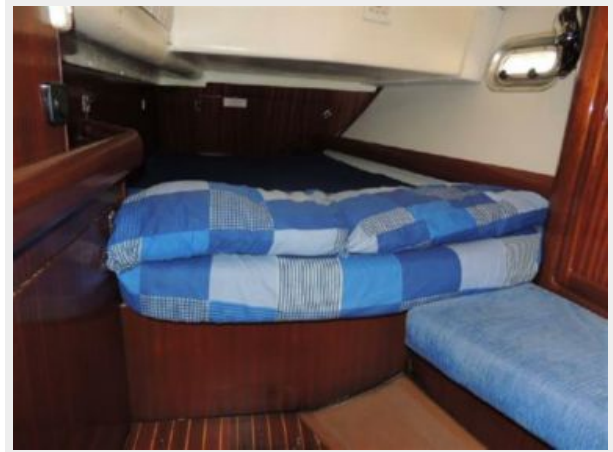
Starboard aft cabin 3