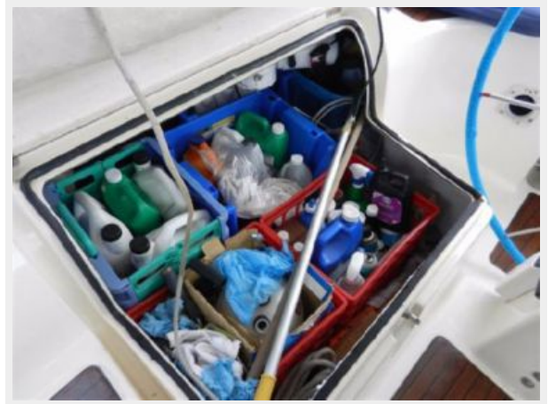
Plenty of storage