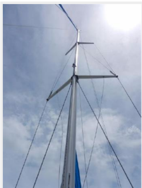
Mast and rigging