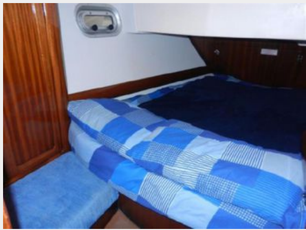
Starboard aft cabin 2