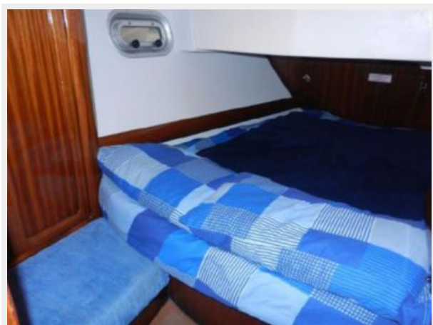
Starboard aft cabin 2