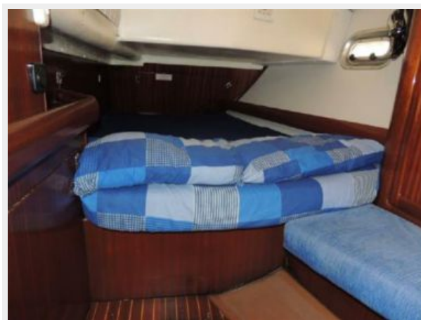
Starboard aft cabin 3