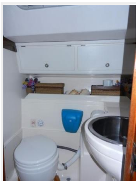
Private aft head 2