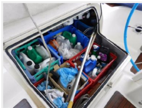
Plenty of storage