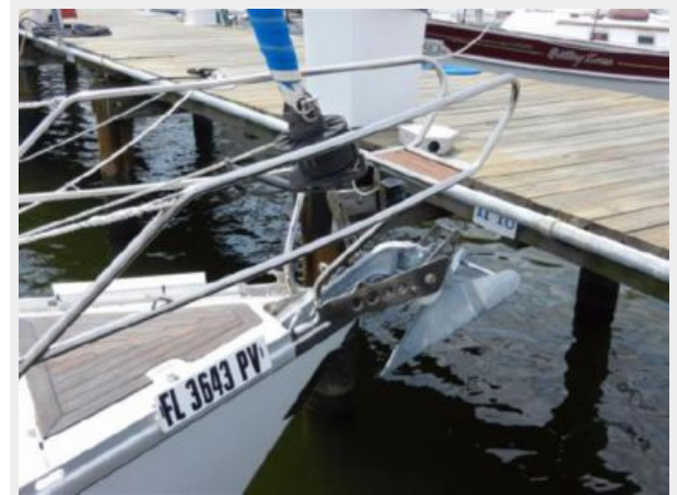
Bow roller and anchor