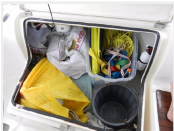
Huge lazarette storage